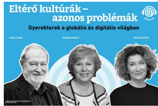
Fig. 3.: Banner of the round table discussion “ Different Cultures – Shared Problems: Child Spaces in a Global and Digital World ”

3. ábra: A kerekasztal beszélgetés beharangozója “ Eltérő kultúrák – azonos problémák: Gyerekterek a globális és digitális világban ”