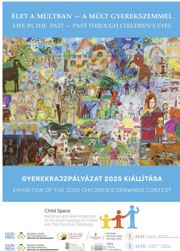
Fig. 5.: Poster of the Child Drawing competition, Life in the Past – Past Through Children’s Eyes . The Photo montage created from the entries to the children’s competition designed by Nóra Mészáros

5. ábra: Az “Élet a múltban — A múlt gyerek-szemmel” című gyermekrajz-pályázat plakátja. A fotómontázs a pályázatra beérkezett alkotásokból készült, tervezte Mészáros Nóra.