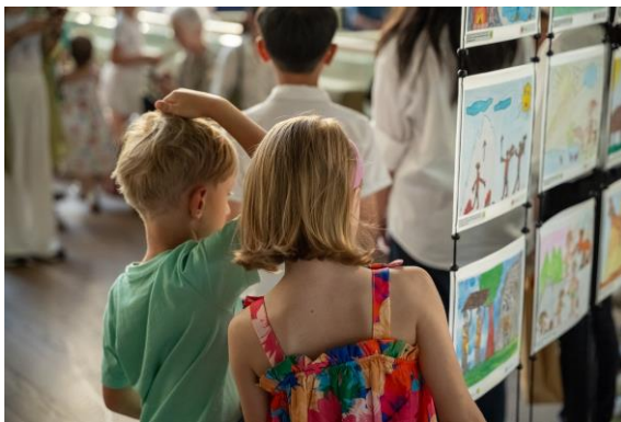
Fig. 6.: A snapshot from the opening of the exhibition 6. ábra: Pillanatkép a kiállítás megnyitójáról

5. ábra: Az “Élet a múltban — A múlt gyerek-szemmel” című gyermekrajz-pályázat plakátja. A fotómontázs a pályázatra beérkezett alkotásokból készült, tervezte Mészáros Nóra.