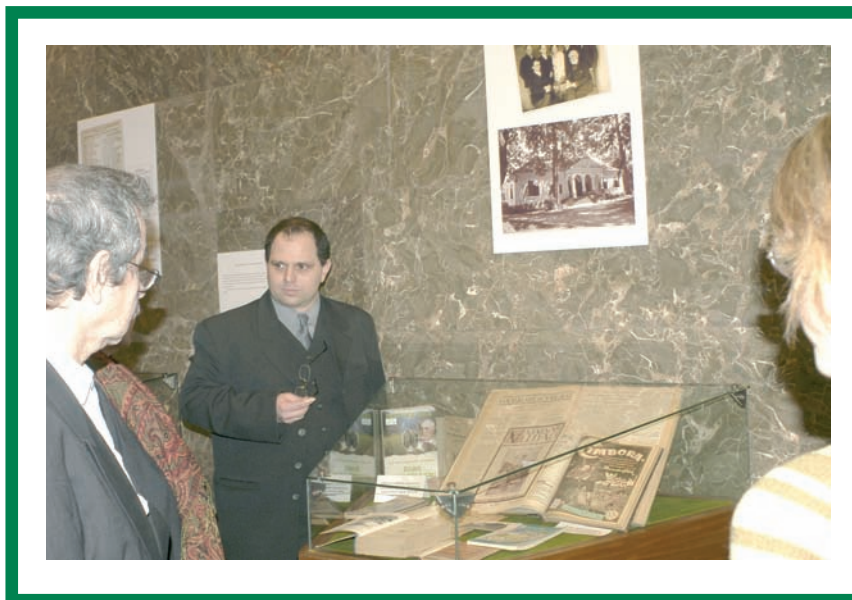
Guiding visitors in the catalogue space on the seventh floor

When preparing for the Millennium, he thought he would live up to the expectations of the celebrations by collecting the treasures of Hungarian folk tales and legends, which his contemporaries deemed an impossible undertaking. He managed to complete the first considerable collection of Hungarian tales and legends through two years of hard work. The work in several