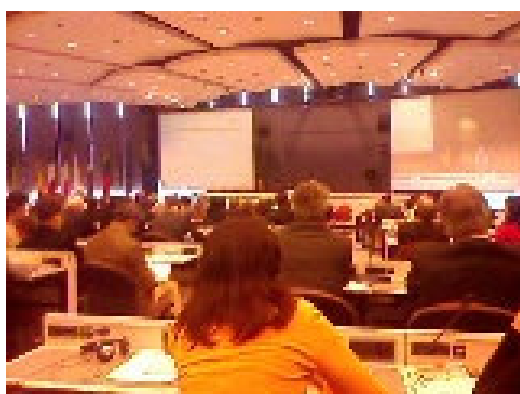
Charlemagne, Brussels, Belgium

The European Union continues the dialogue with the regulators and the actual cultural operators. The next conference is about involving civil society to promote culture with different objectives however for a single goal: to have a better Europe. The Culture Ministers of the EU Member States endorsed the European Agenda for Culture. It was prepared last November on the basis of the Communication presented by the Commission in May 2007.