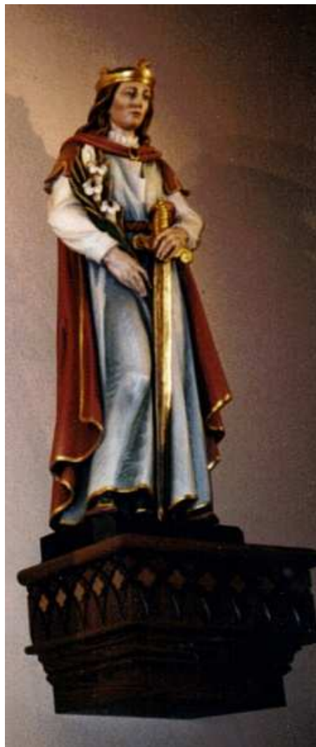
Statue in Saint Emery Church, Fairfield, CT