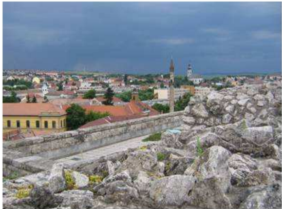
View of Eger from the fortress - note the minaret

If you go to Hungary, I suggest you make time to visit this charming city with its historic fortress. It will definitely be worth your while.