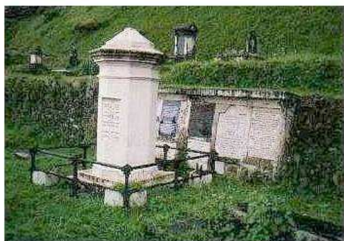
Grave of Sándor Kőrösi Csoma in Darjeeling, India