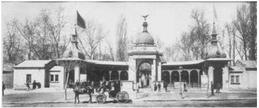
Zoo entrance in 1895

The 145 th anniversary celebration lasted for 3 days. On the reopening, the original opening day was commemorated by reenactments; present