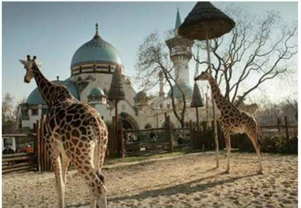
Giraffes in the West Africa House

were " Erzsébet királyné , Rottenbiller Lipót , mayor of Pest , Klotild szász hercegnő (Saxon), Deák Ferenc and Xantus János ".