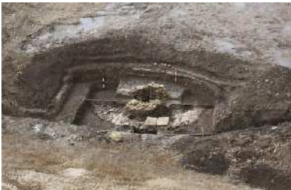
The excavation site