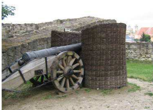
Old cannon reminds us of the siege