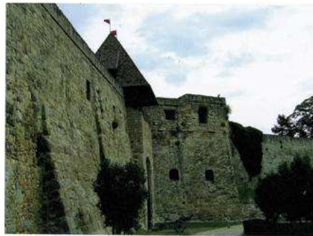
Part of the thick walls that withstood the Turkish onslaught