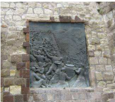
Plaque commemorating the defense of the fortress with the help of the women