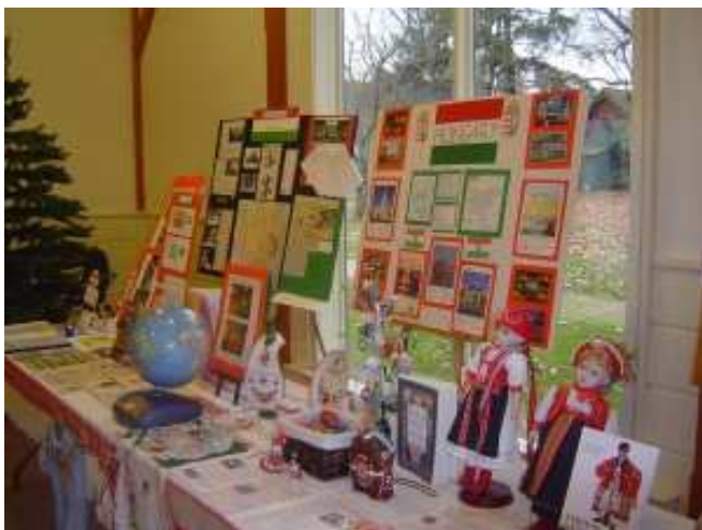
"Celebrating Our Cultural Legacies: Fairfield's Hungarian Community" at the Fairfield Museum & History Center in 2009