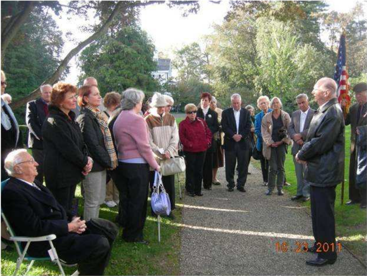
Some of the participants of the Commemoration at the Fairfield Plaque.