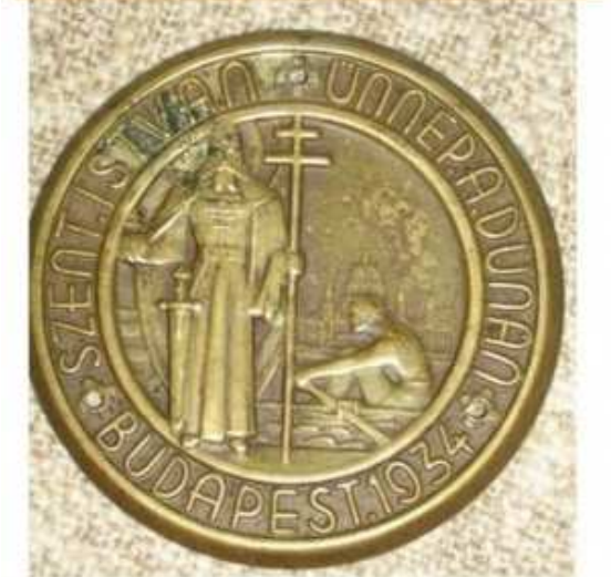
Third prize a silver cigarette case, the sulking coxswain and his uncle, Bronze plaque to be attached to the boat

of the boat between my Uncle's legs, not as a participant but as an idle spectator, having been displaced from my rightful coxswain's seat. Boy, was I mad, as a picture of the two of us clearly shows!