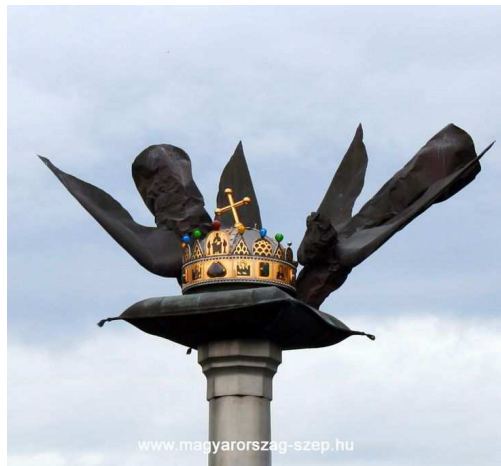
The monument in Szarvas

Today, Szarvas has a population of 18,000. The monument with the replica of St. Stephen's Crown flanked by two angels (as seen on our header this month) was created by Mihály Gábor and erected for the Hungarian millennium in 2000. It stands on top of a 15 m (about 45 ft.) high column.