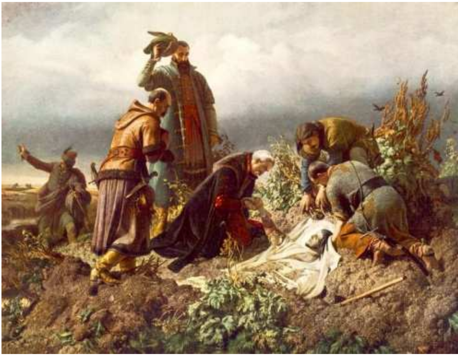
The finding of the body of King Lajos II painted by Székely Bertalan

kapuját. A déli végvárvonal nem zárt többé, megnyílt az út az ország szívébe. Az egyes országok ahelyett, hogy összefogtak volna a hatalmas török sereg ellen, elfordultak tőlünk.