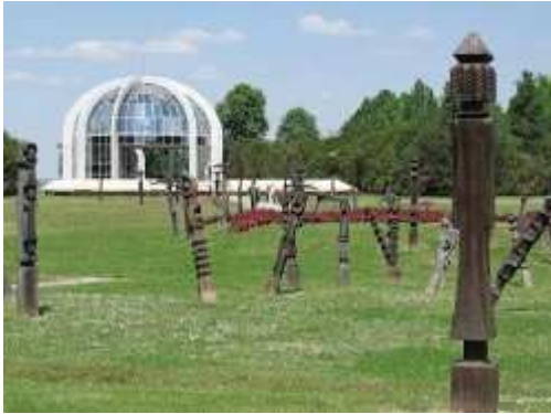
Memorial park in Mohács

On August 29 th , Hungarians remember the disastrous Battle of Mohács, which determined the fate of Hungary from that day forward. It marked the beginning of 160 years of Turkish occupation, followed by Austrian rule. Here is a brief summary of that historic battle.