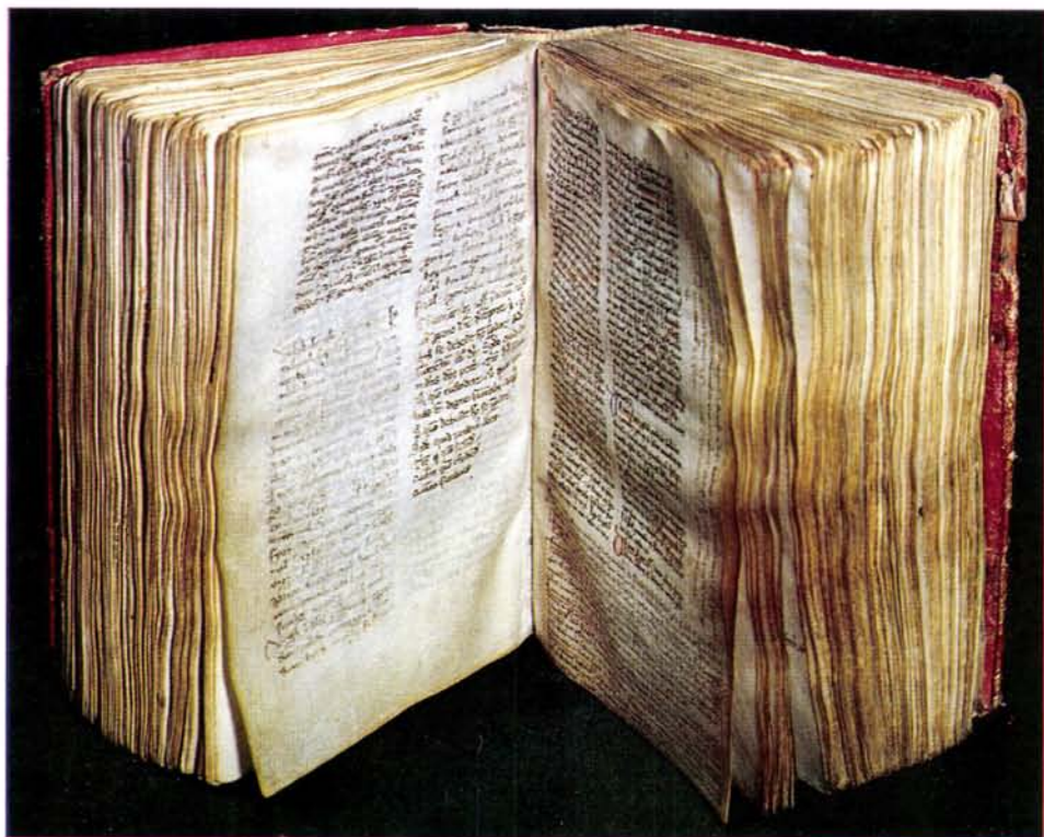
Abb. 1. Der geöffnete Kodex (links: die ungarische Marienklage, rechts: Anfang der Sermonesreihe „De sanctis“)