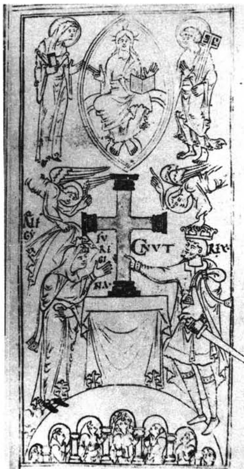
Fig. 6 Knut, King of Denmark and England, with Queen Aelfifu. Liber vitae (Hyde Abbey). London, British Museum, Stowe Ms. 944, fol. 6r. 1020–1030 A. D.

crown, in his book published in 1613—"often smile or even look at us angrily when hearing that we call the crown holy, angelic, apostolic or other similar names". He wrote this work primarily with the intention of "making other peoples understand better why we, Hungarians, talk about the religion of our crown ( Religionem hanc nostrae Coronae ) and why we believe in it". If, however, the Hungarians were able to believe in the angelic origin of their crown like the Byzantines, the spreading of this belief cannot be supposed to have taken place later than the 11th century. Saint Stephen had issued documents in Greek which were still understood in the age of Coloman, although by then were translated into Latin.