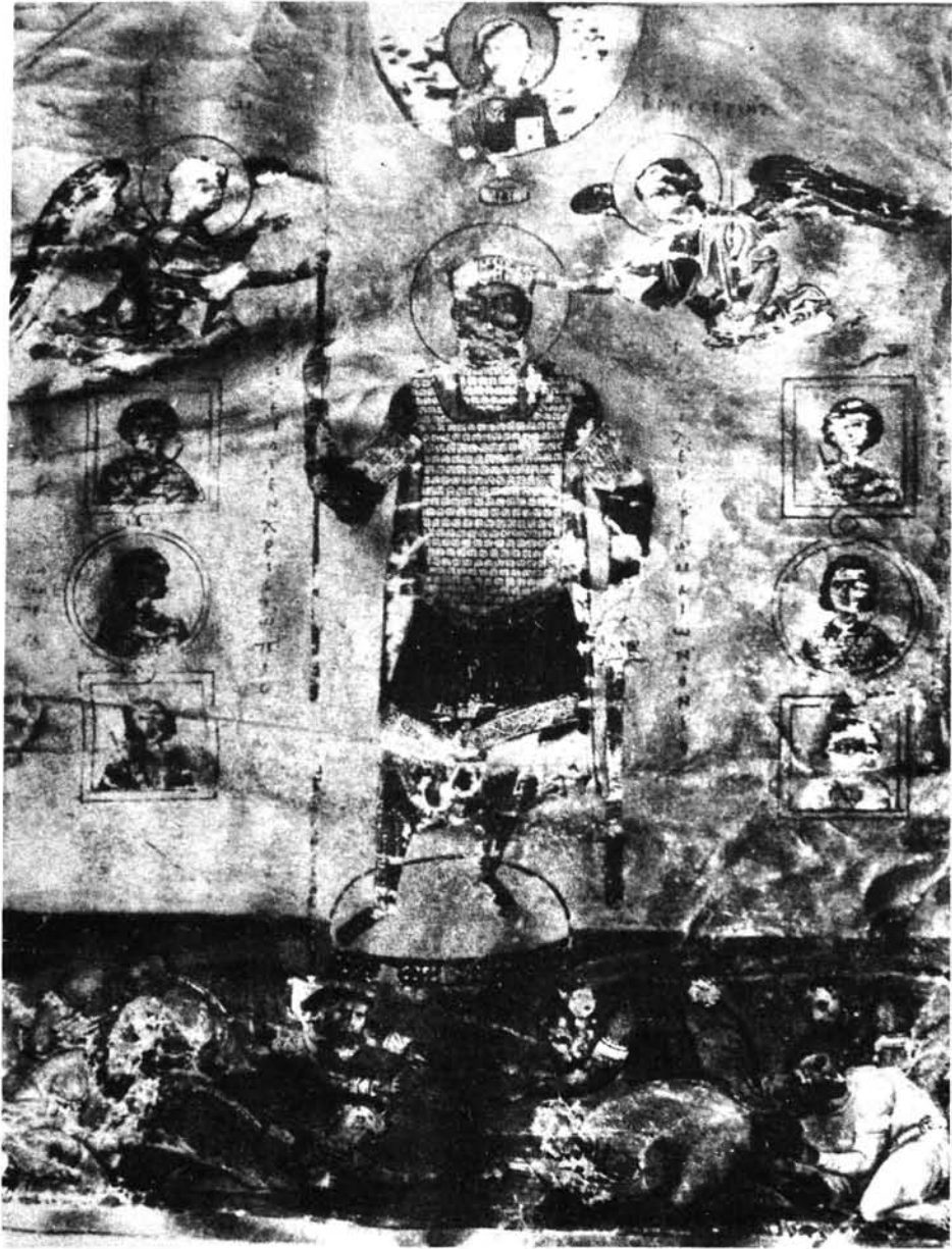
Fig. 1 Basileos Bulgaroktonos II.

Miniature from Codex gr. 17 , fol. 3. Manuscript, Venice, Bibl. Marciana, after 1017 A. D.