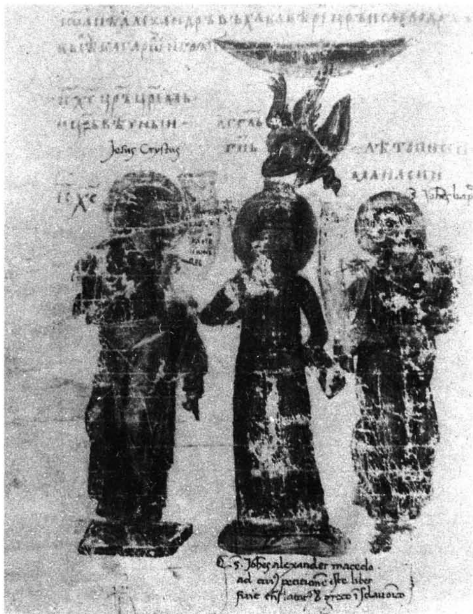
Fig. 4 The Bulgarian Tzar Ivan Alexander (1331–1371 A. D.). Illustration from the Manasses-Chronicle . About 1345 A. D. Rome, Bibliotheca Apostolica Vaticana.