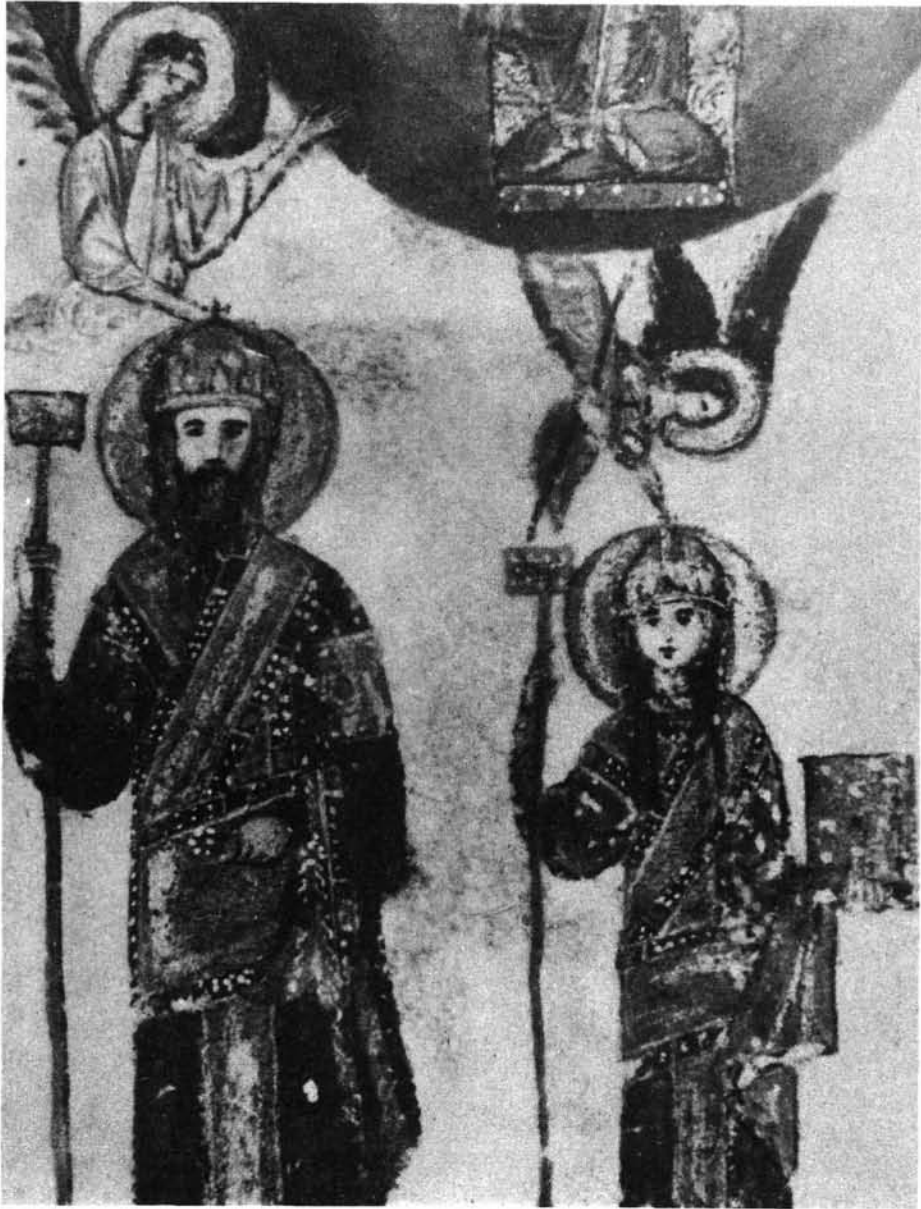
Fig. 3 Detail from a miniature portrait of an unknown emperor. Psalterium Barberini . Cod. Barb. gr. 372, fol. 5 r . Rome, Bibliotheca Apostolica Vaticana. After Manuel I (died in 1180 A. D.)