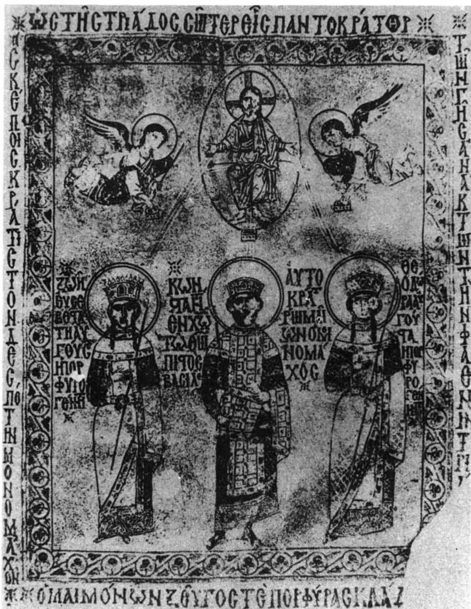
Fig. 2 Emperor Constantinos Monomakhos with Zoe and Theodora. Miniature from Codex Sinait. 364. Manuscript, 11th century A. D.