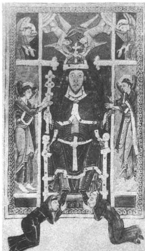
Fig. 5 St. Edmund, King of England. Miracula Sancti Edmundi . Pierpont Morgan Library, New York. About 1125–1145 A. D.

It looks very much as if this passage by the Byzantine emperor is about the Holy Crown of Hungary. The Hungarian crown was also seen in the glory of sanctity since people thought it had been given by the angel and it was guarded as a relic in the Maria Church in Székesfehérvár. All the kings were crowned with it and they were allowed to wear it on the three major holidays, Christmas, Easter and Pentecost. They also wore a crown on other days and for other events as well, but this was not considered holy by their subjects as it had not been given by an angel. From this it is obvious that the Holy Crown was not surrounded by sanctity because it was considered as belonging to Saint Stephen by common knowledge. For when the Holy Crown was retained by Elizabeth, widow of Albert, in vain did they crown Wladislas I in 1440 with the crown taken off the head relic of Saint Stephen: it could in no way replace the sanctity of the Holy Crown. The sanctity of the Holy Crown was bestowed by the fact that it had been brought by an angel from Heaven. Strangers—writes Péter Révay, keeper of the