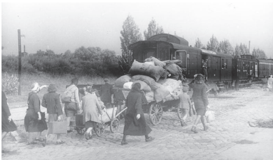
Figure 4. Conflict in Post-War Yugoslavia, Former Yugoslavia, Historical photograph.