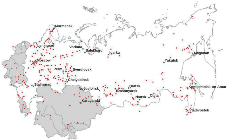
Figure 7. GULAG Map. The map illustrates the GULAG camps where Hungarian and other ethnic prisoners were kept in the USSR. Digital map, accessible via the Gulag Online project.