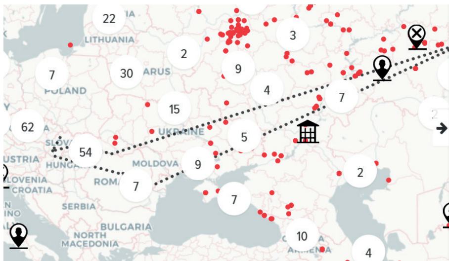
Figure 6. GULAG Map. The map showing the logistics of deportation from Hungary to the USSR (the same routes were often used for the Balkans as well). Digital map, accessible via the Gulag Online project.