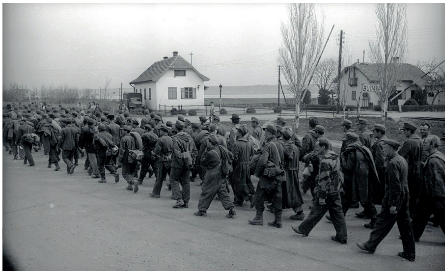
Figure 3. Axis invasion of Yugoslavia, Yugoslavia, Historical photograph.