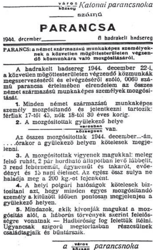
Figure 1. Order No. 0060 of December 22, 1944, of the 2nd and 3rd Ukrainian Front on the deportation in the territories occupied by the Soviets.

deportees: prisoners of war and civilians (Várdy 2007). However, as T. Stark has noted, many civilians deported to the USSR were officially classified as prisoners of war, which obscures their ethnic background and political status (Stark 2003). This circumstance leads to a systematic underestimation of the scale of ethnic cleansing and political repression directed against the Hungarian population.