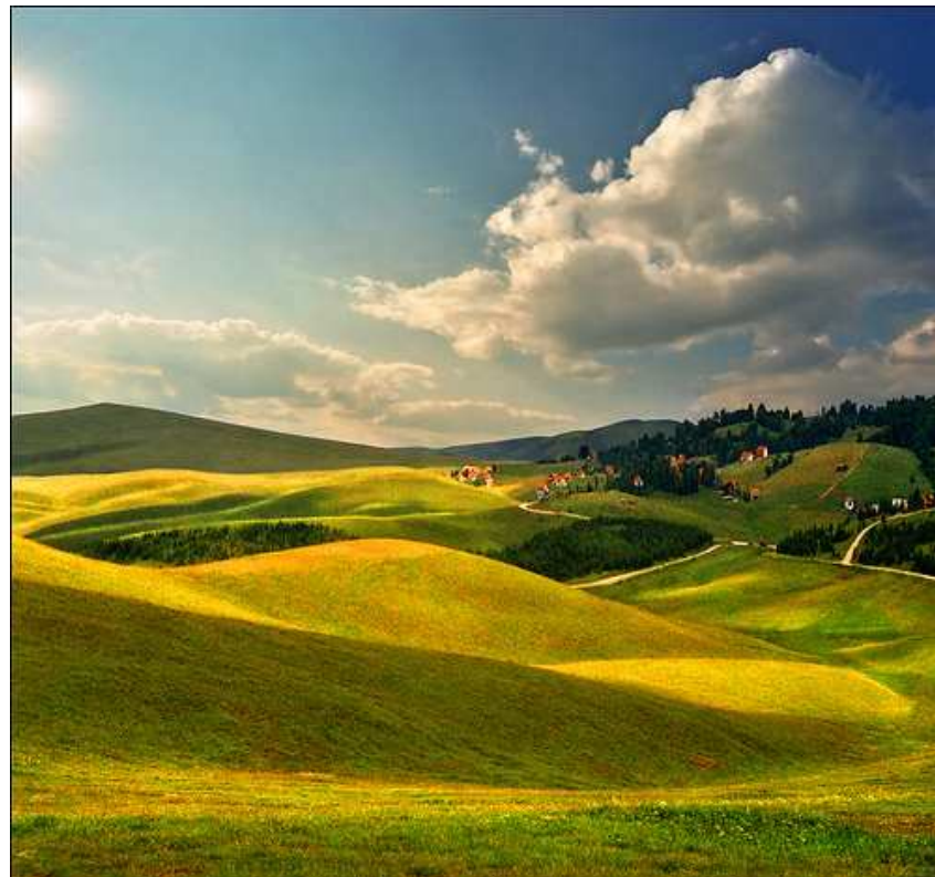
Landscape of Zlatibor