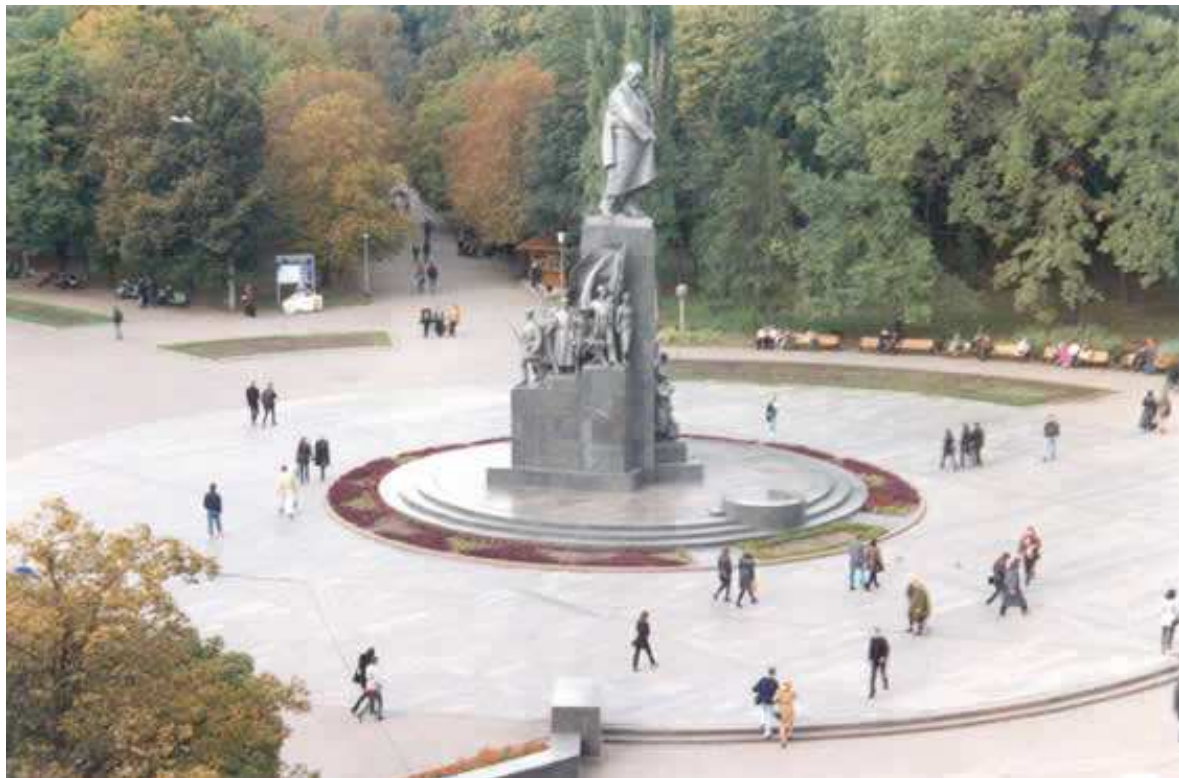
The Statue of Taras Shevchenko

Role of J Project Meetings in improvement diagnostics of PID in children in Ukraine