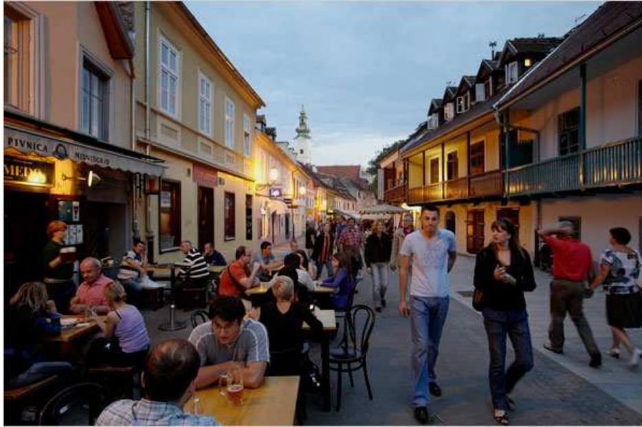
The quarter where the get together dinner took place