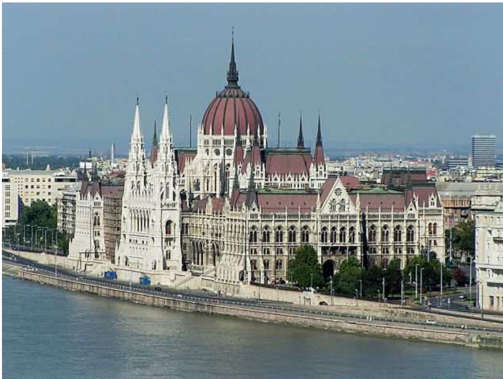
The Parliament of Hungary