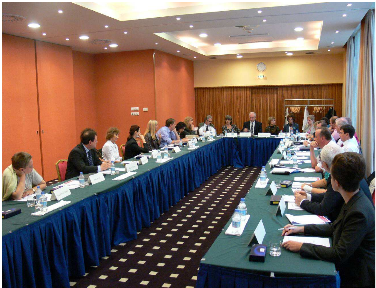
The J Project Steering Committee