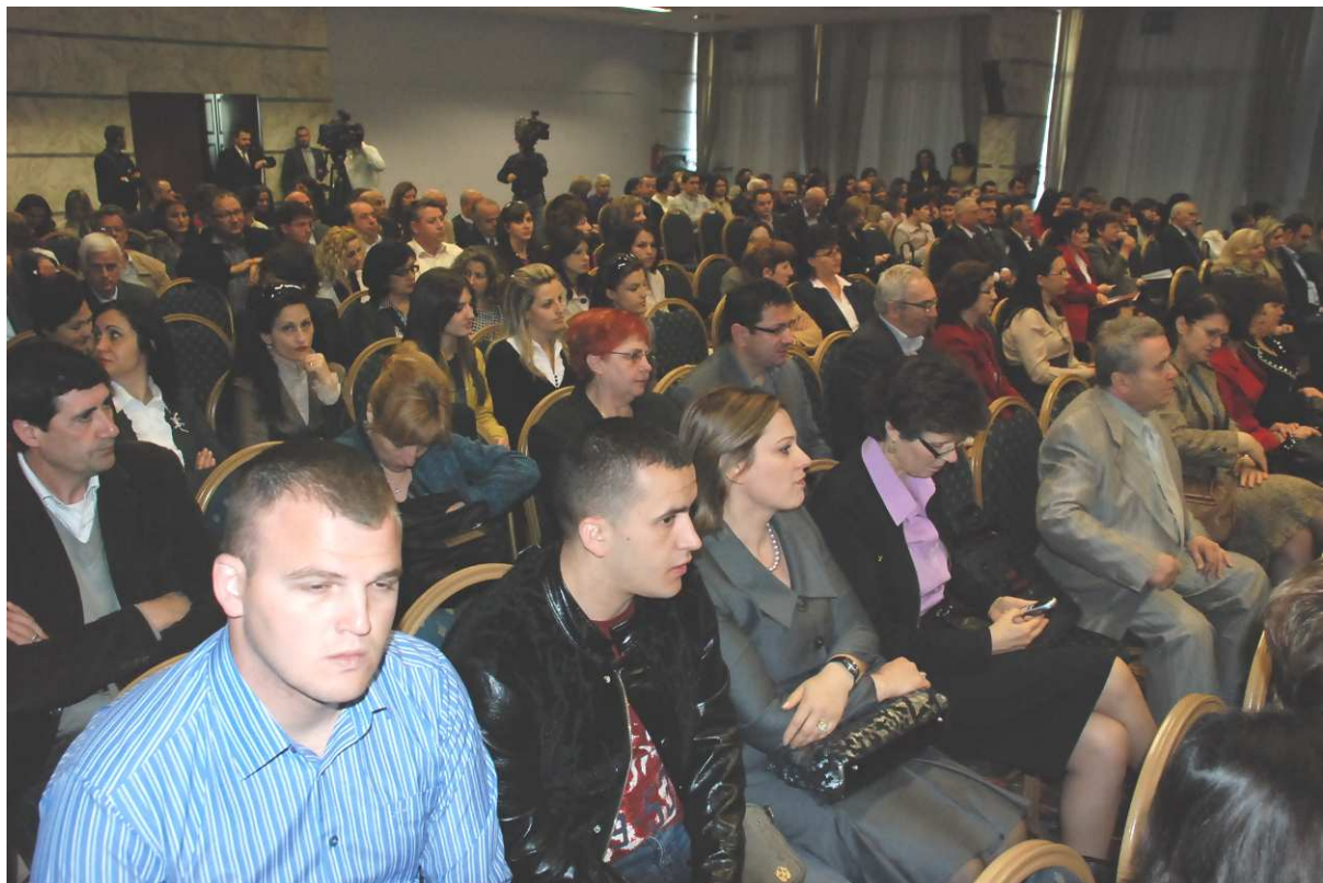
Participants of the Meeting