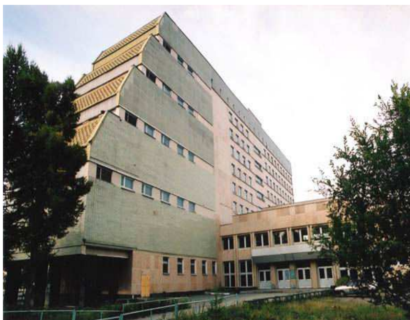
Chelyabinsk State Medical Academy