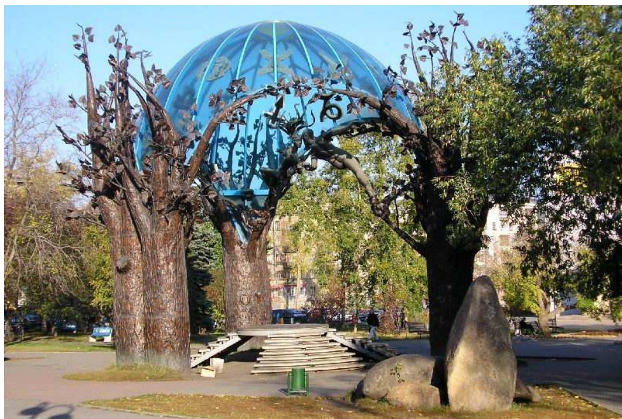
"Sphere of Love"