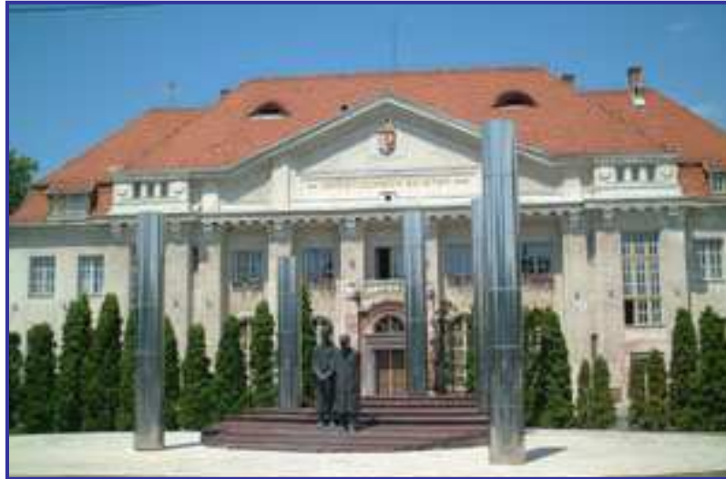
University of Debrecen Medical and Health Science Center