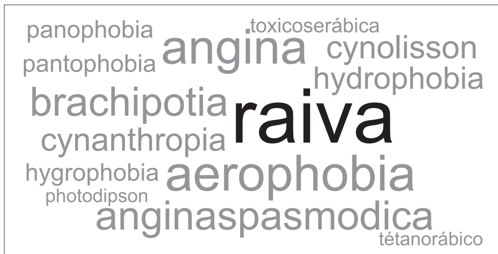
Figure 3. Nomenclature of rabies in the sources. Source: Inaugural Dissertations Presented at the Porto Medical-Surgical School. Image created using AntConc.

formulated the following argument: “the notion that the rabid animal does not drink and has a fear of water continues to be deeply rooted; and yet, the rabid dog does drink, it drinks frantically.” 77