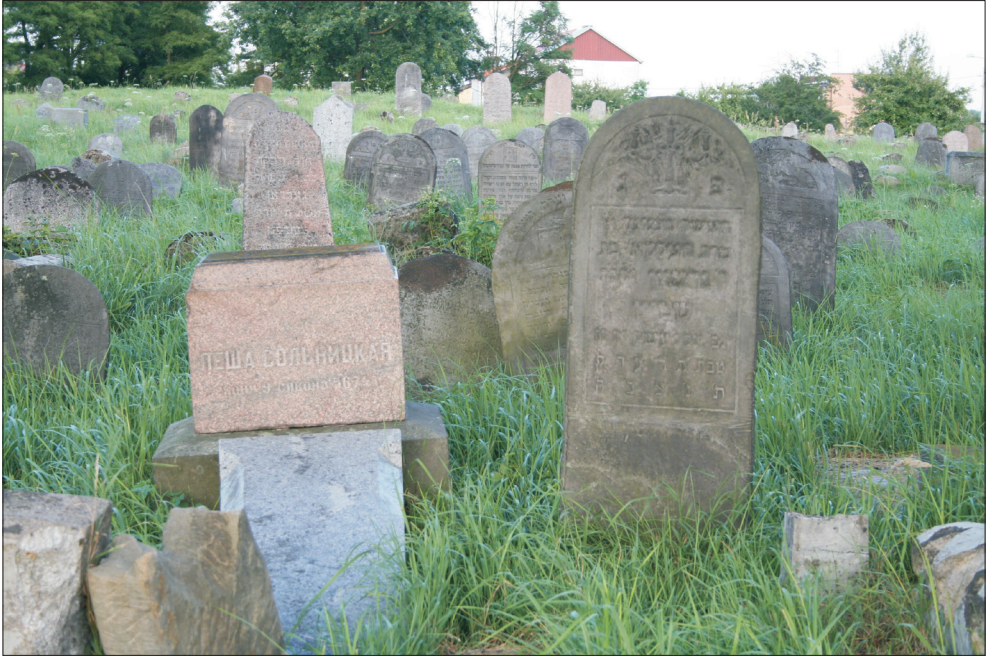
Photo 3. The Jewish Cemetery (Wschodnia street)

Next to the Jewish Trail, other thematic routes focusing on the multicultural character of the city were also created, e.g. the Ludwik Zamenhof and Many Cultures Trail or the Białystok Temples Trail, showing the city's religious and architectural diversity (Photo 4–5).