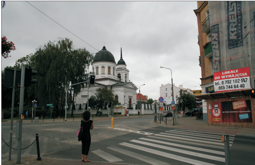
Photo 5. Orthodox church of St. Nicholas