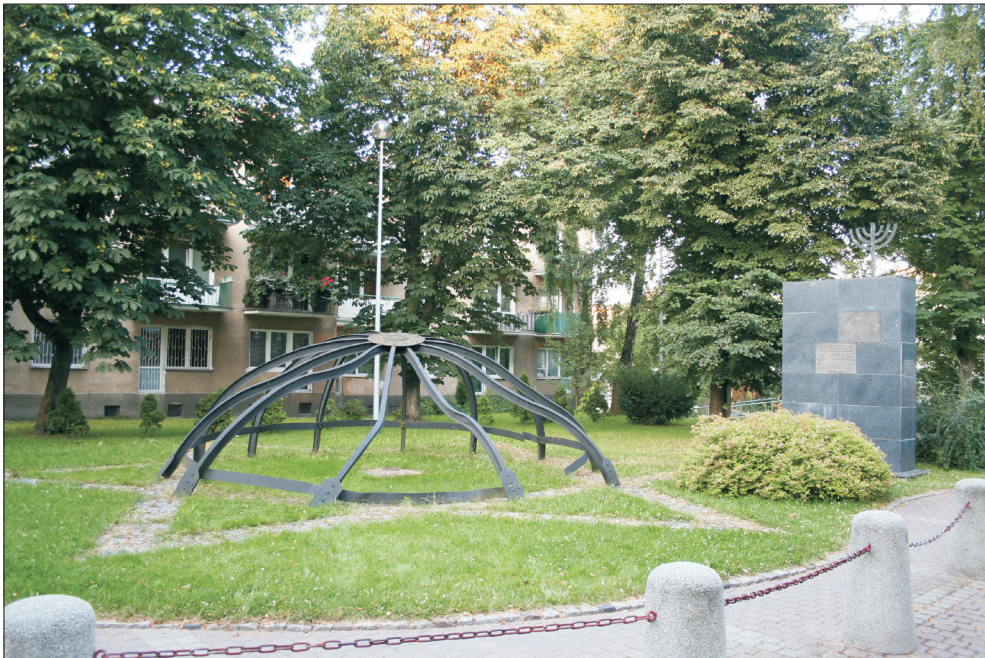
Photo 2. The Monument of the Great Synagogue