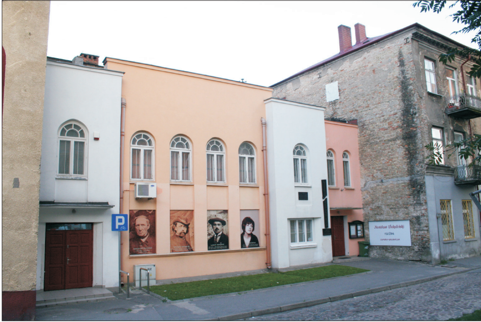
Photo 1. Cytron Synagogue (now Art Gallery of the Slendzinskis)