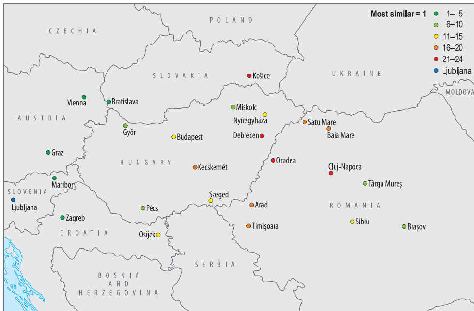
Fig. 4. Result of the similarity search analysis.

areas within the city, per capita CO 2 emissions, and daily drinking water consumption compared to the national average. These factors placed it among the top three cities. However, its performance in other indicators was somewhat poorer, falling more into the middle range. Pécs benefits from a high proportion of Natura 2000 areas within its city limits due to the presence of the Mecsek Mountains, many of which are located within the administrative boundaries of Pécs and are under various protection statuses. Győr did not rank among the top three in any environmental indicators. In fact, it falls into the bottom three cities regarding per capita CO 2 emissions and the percentage of pedestrians in the city. On the positive side, Győr has the third highest per capita green area in the ranking, with 29.8 m 2 per person. It is surpassed only by Szeged (34.7 m 2 /person) and Kecskemét (36.4 m 2 /person). Miskolc excels in terms of Natura 2000 areas, where it holds the first position when considering its