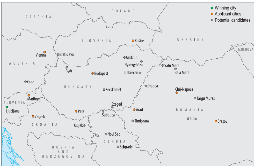
Fig. 3. Cities covered by the analysis.

To explore the similarities and differences in environmental values, we used independent samples t -test (Student's t ), Mann-Whitney U -test, Chi-square test of independence, random forest and a geospatial tool, the similarity search. It is important to emphasize that this research is conceived as an exploratory analysis (EDA), i.e., we do not aim to prove or disprove specific hypotheses, as EDA uses different statistical methods to test the strength of the relationship, not to prove hypotheses (VELLEMAN, P.F. and HOAGLIN, D.C. 2012). TUKEY, J.W. (1977) described EDA as detective work, the aim of which is to uncover patterns. The purpose of a discovery analysis is to detect some pattern, difference or similarity in the values of the items under investigation (FIFE, D.A. and RODGERS, J.L. 2022). Although controversial, it appears that the p-value has at least some relevance in exploratory studies (RUBIN, M. 2017), and