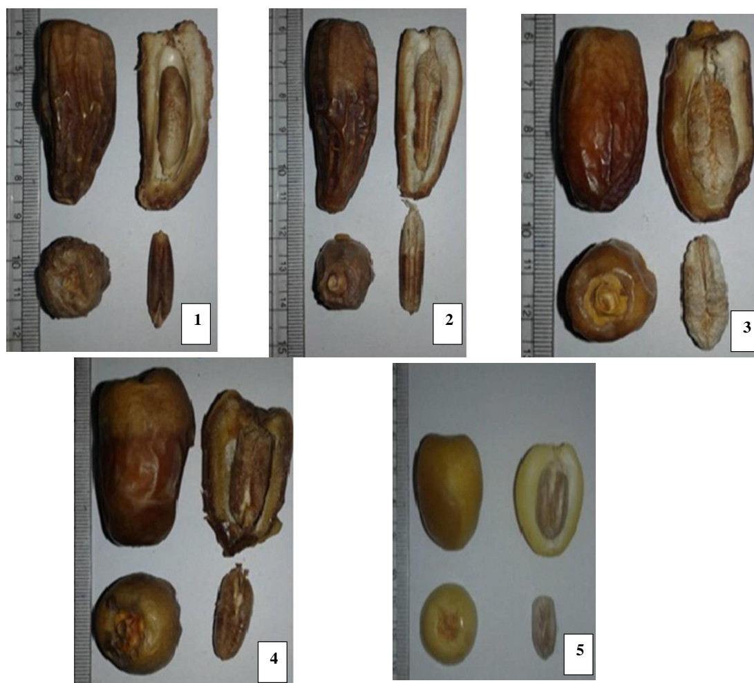
Figure 1. The fruit of five date palm cultivars. 1 Bartamoda, 2 Sakoty, 3 Soltany, 4 Sewy, and 5 Barhy

Regarding number of bunches and yield/palm, Barhy cv., had the highest number of bunches (18.8 and 18.66) and yield/palm (195.4 and 197.21 kg) followed by Sewy cv. in both seasons. On other hand, Sakoty cv. gave the lowest number of bunches (9 and 8.8) and yield/ palm (80.5 and 81 kg). These results are in harmony with present results those obtained by Abo-Rekab et al. (2014), Idris et al. (2014), Mortazavi et al. (2015), Nasir et al. (2015), Omaima, et al. (2015), Qadri et al. (2016), Abd-El Hamed, et al. (2017). Who found that Sakoti gave the lowest seed weight in both seasons (0.961 and 0.985 g, respectively) (Abo Rekab et al., 2010). These data are in agreement with El-Merghany et al. (2013) they found that Barhy cv. gave the highest yield/palm in the second season.