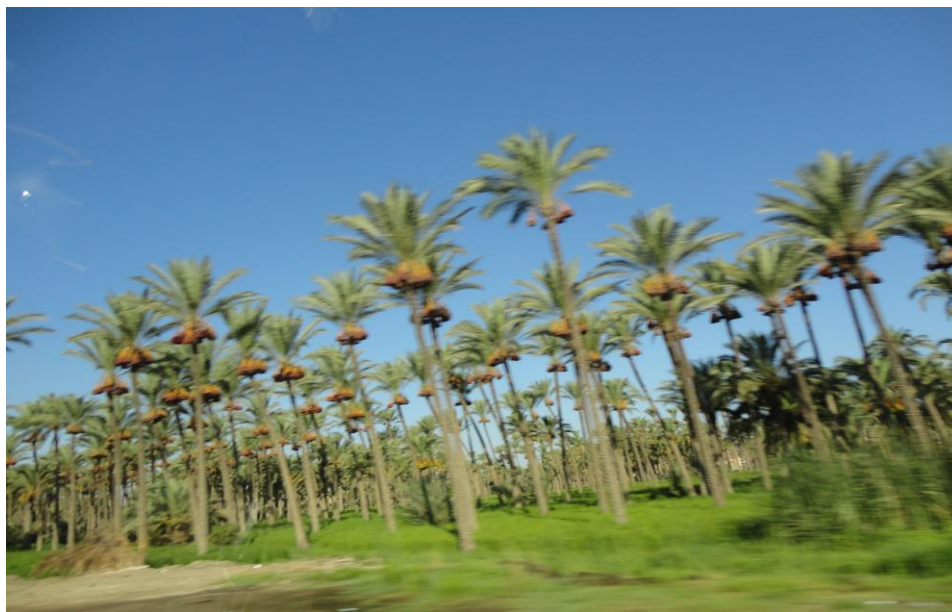
Figure 2. Experimental Orchard date palm trees in Baltim, Kafr El Sheikh Governorate, Egypt

Fifteen soft seedling strains (Limony, Elhamra, Elhelowa, Nwat Elbahr, kopyy, Zenat Ahmer, Zenat Asmar, Ostora, Nwat zaghoul, Nemery, Om Makatif, and Meghal) were selected from a big number of excellent seedling palms beside three trees of local cultivars (Hayany, Samany and Araby) as a standard control. The selected palms were about 15-17 years old, grown in sandy loam soil and they characterized by high yield and fruit quality (Fig. 2).