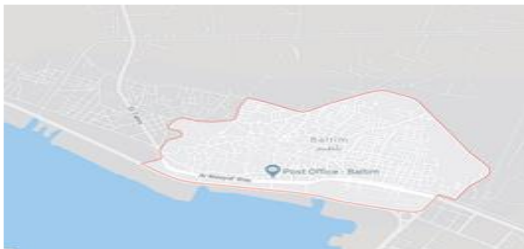
Figure 1. Baltim district, Kafr El-Sheikh, Egypt

This study was conducted during 2017 and 2018 seasons at a private orchard in Baltim district (located at North Delta region Kafr-El-Sheikh Governorate (31° 15' 35" N, 31° 9' 36" E), Egypt. Baltim's climate is typical to the northern coastal line which is the most moderate in Egypt. It features a hot desert climate, but prevailing winds from the Mediterranean Sea greatly moderate the temperatures, making its summers moderately hot and humid while its winters mild and moderately wet ( Fig. 1 ).