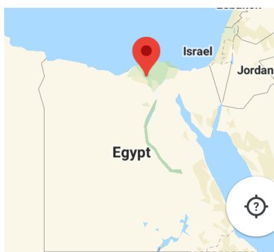
Figure 1. Experimental site location

The present investigation was conducted during two successive seasons (2016 and 2017) in a private orchard of the modern agriculture company (PICO) located at Badr city (30°36'36.5"N and 30°45'45.5" E), El Behera governorate, Egypt ( Fig. 1 ). Monthly average of some metrological data during study period of the experimental site is illustrated in Figure 2 .