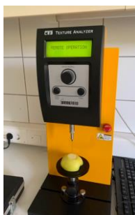
Figure 2: Texture Analyzer CT3

Flesh firmness was determined using Brookfield CT3 Texture Analyzer on TA-RT-KIT baseboard using TA 9 pin probe body. (Fig 2.) For evaluation of measurement parametric data (test type: TPA, target type: distance, trigger load: 6.8 g, test speed: 5 mm/s, target value: 5,0 mm [15] and results TexturePro CT V1.2 Build 9. Software was used.