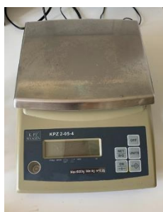
Figure 1: Digital precision balance

The measurement of weight loss was a key parameter during the experimental period, as it directly indicates the loss of moisture content in the apple, which affects the freshness and shelf life of the fruit. Weight loss was measured using a digital scale. (Fig 1.) (Germany, Hamburg, type KPZ 2-05-4, 0-6kg ±0,2g)