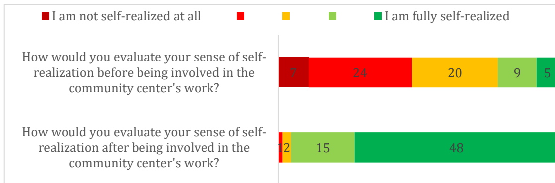
Figure 2: Sense of self-Realization before and after being involved in the CBOs' work (Frequencies)