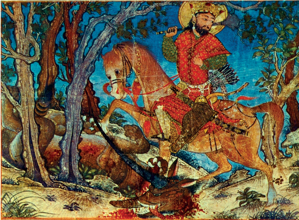
Persian miniature. Scene from the Demotte or "Great Mondol Shahnameh", a key Ilkhanid work, 1330s.

and renderings of the Medieval Arabic and Persian sources into the corresponding modern registers. 3