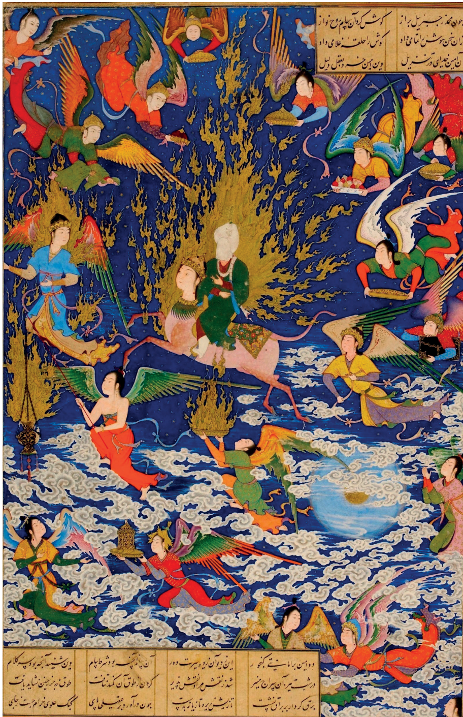
Persian miniature. Mi'raj of the Prophet by Sultan Muhammad, showing Chinese-influenced clouds and angels, 1539.