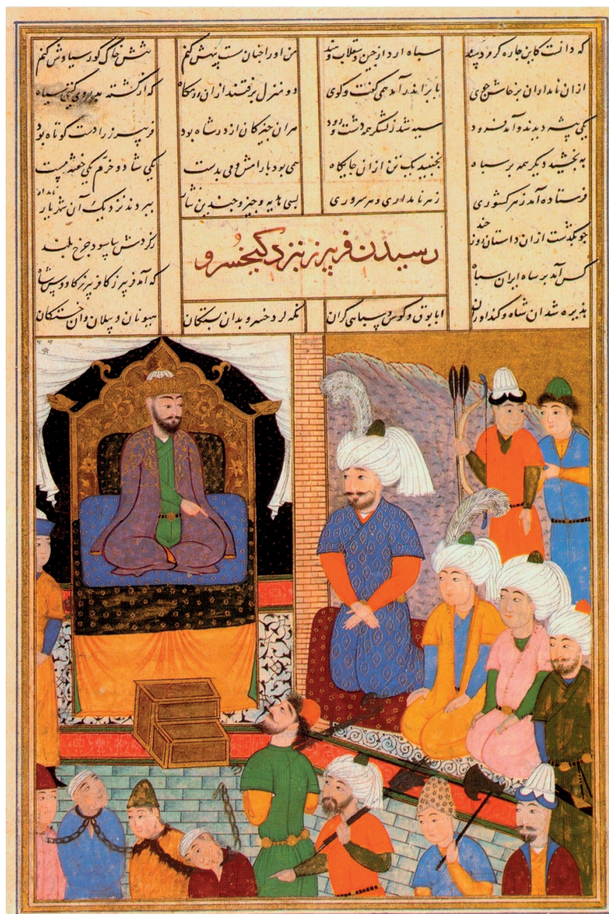
Persian miniature. Page from the Turkmen „Big-head Shahnameh”, Gilan, 1494.