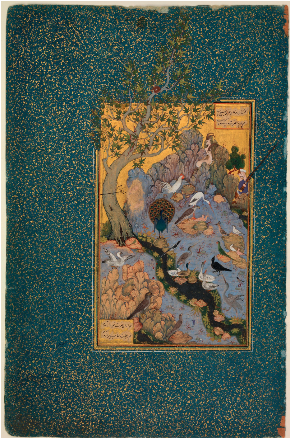
Persian miniature. Scene from Attar's Conference of the Birds, c. 1600.