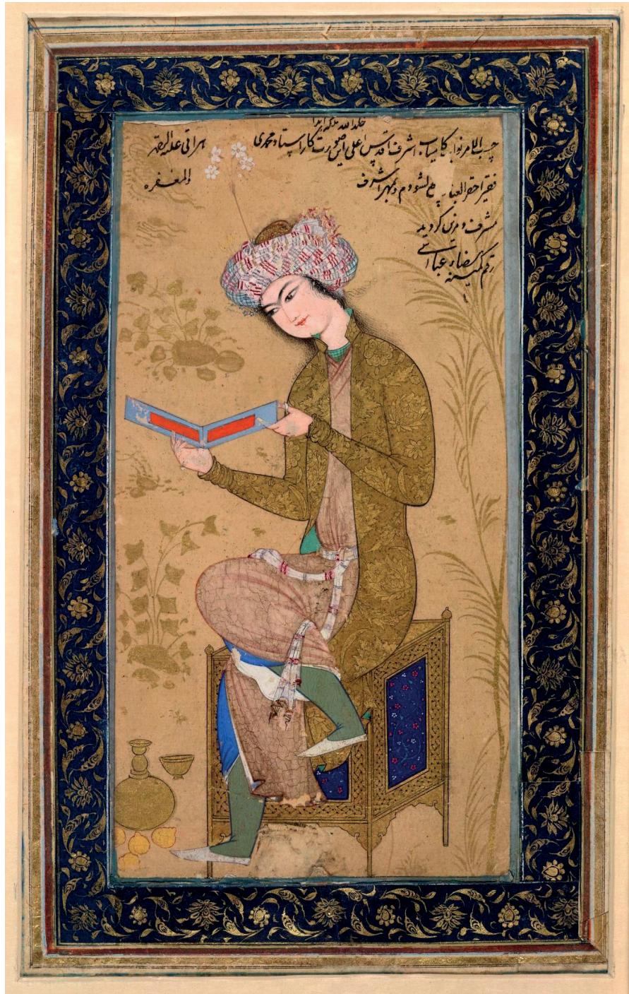
Persian miniature. Youth reading, by Reza Abbasi, 1625–1626.