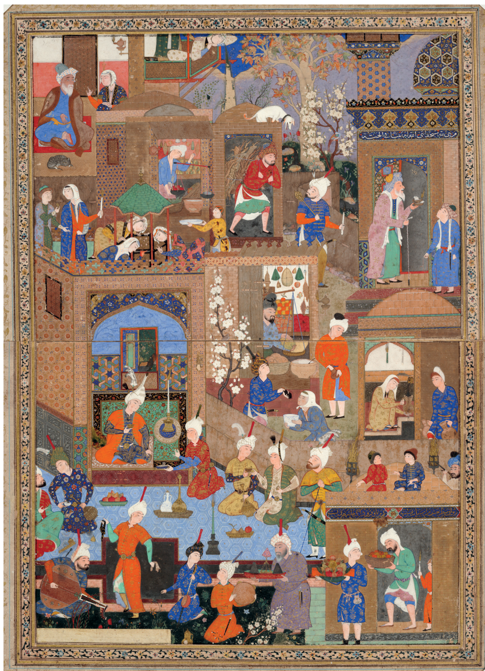
Complex palace scene, 1539–1543, Mir Sayyid Ali