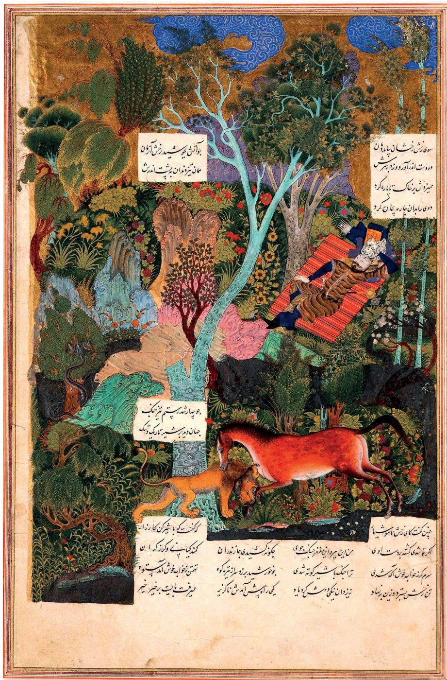
Rustam sleeps, while his horse Rakhsh fends off a tiger. Probably an early work by Sultan Mohammed, 1510–1520.