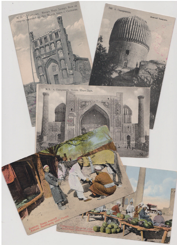
Some of the picture postcards from the estate: Samarkand, Kokand and Skobelev