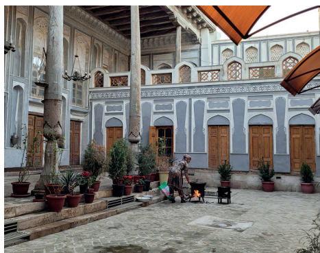
Above left: Khiva: view of the Inner Castle (Ičān qalʿa).