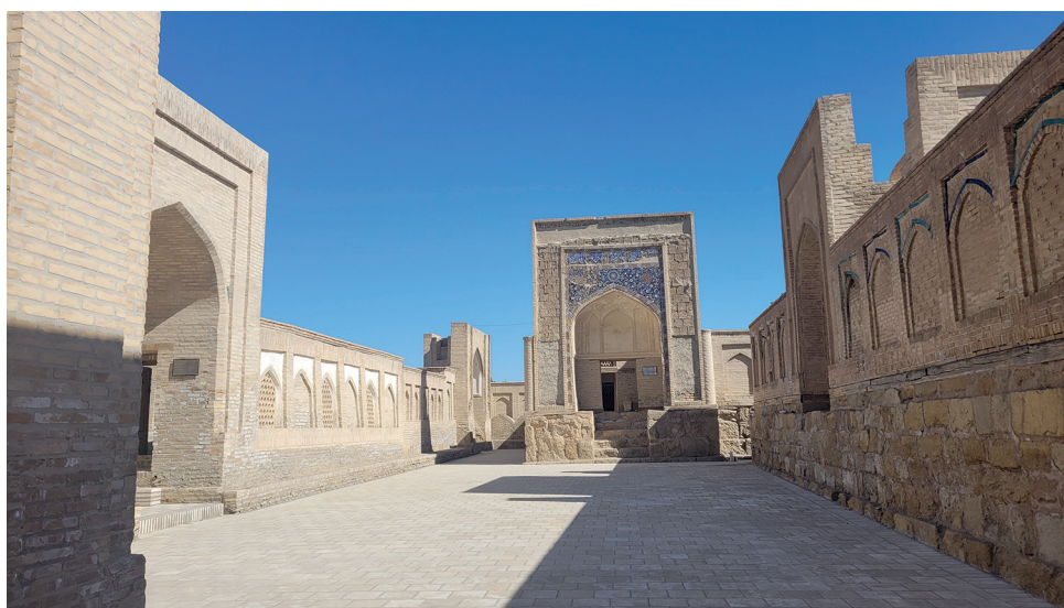
Above left: Samarkand: Šāh-i zinda (Living King) pilgrimage site Above right: Khiva: Kalta minār (Truncated minaret) Ičān qal'a (Inner castle) Below: Čahār Bakr (Four Bakr) necropolis near Bukhara