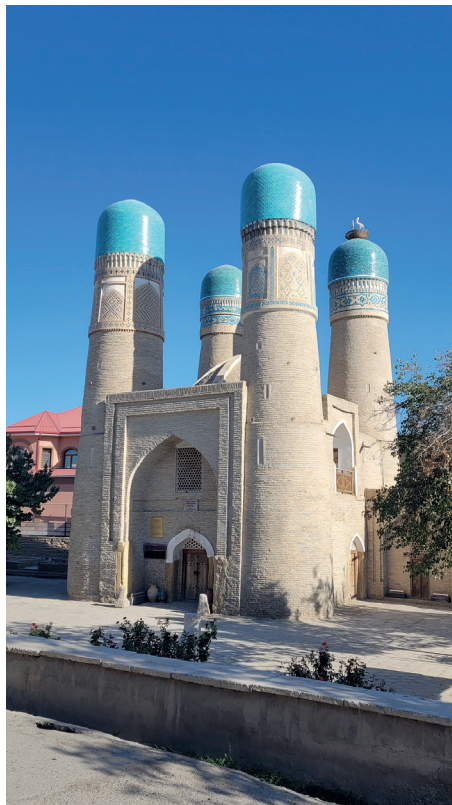
Above left: Bukhara: Mīr-i ʿarab madrasah Above right: Samarkand: Registan square Below left: Bukhara: Oibinok mosque Below right: Bukhara: Čahār minār (Four minarets) madrasah