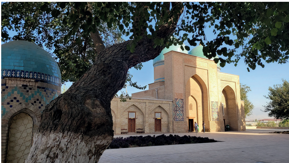
Above left: Samarkand: Registan square, Ulugh Beg's madrasah Above right: Samarkand: Soghdian fresco from Afrasiyab In the middle: Samarkand: Soghdian fresco from Afrasiyab Below: Shahrisabz: Dār al-Tilāvāt (House of Recitation) quarter