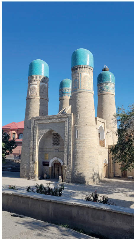
Above left: Bukhara: Mīr-i ʿarab madrasah Above right: Samarkand: Registan square Below left: Bukhara: Oibinok mosque Below right: Bukhara: Čahār minār (Four minarets) madrasah