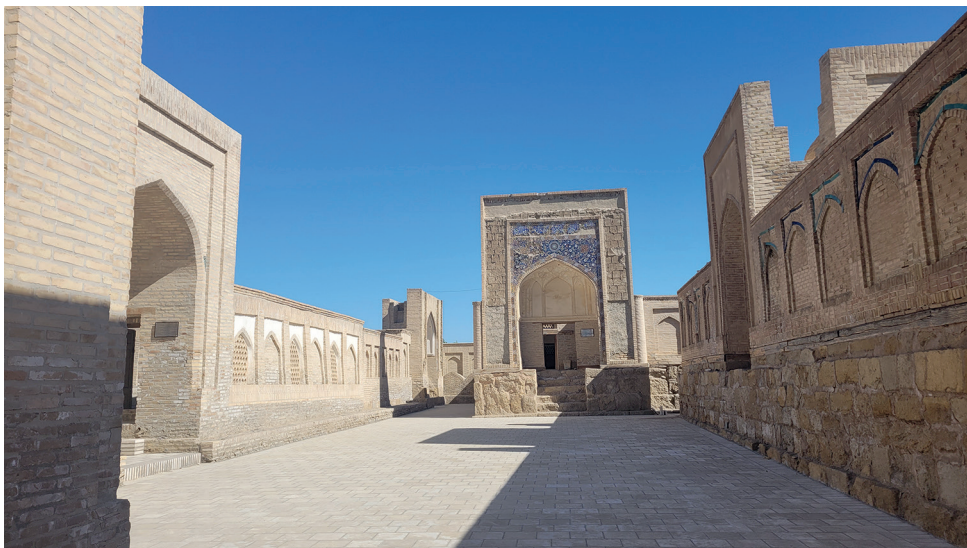
Above left: Samarkand: Šāh-i zinda (Living King) pilgrimage site Above right: Khiva: Kalta minār (Truncated minaret) Ičān qal'a (Inner castle) Below: Čahār Bakr (Four Bakr) necropolis near Bukhara