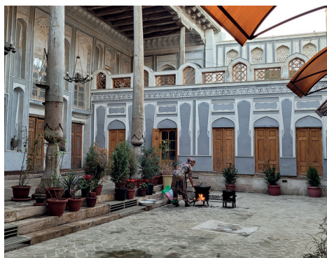
Above left: Khiva: view of the Inner Castle (Ičān qal'a).