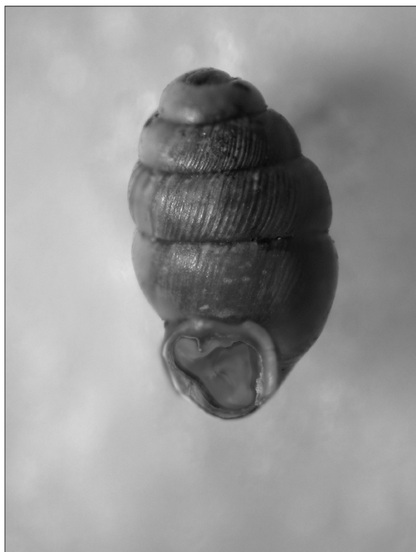
Fig. 1. Vertigo angustior