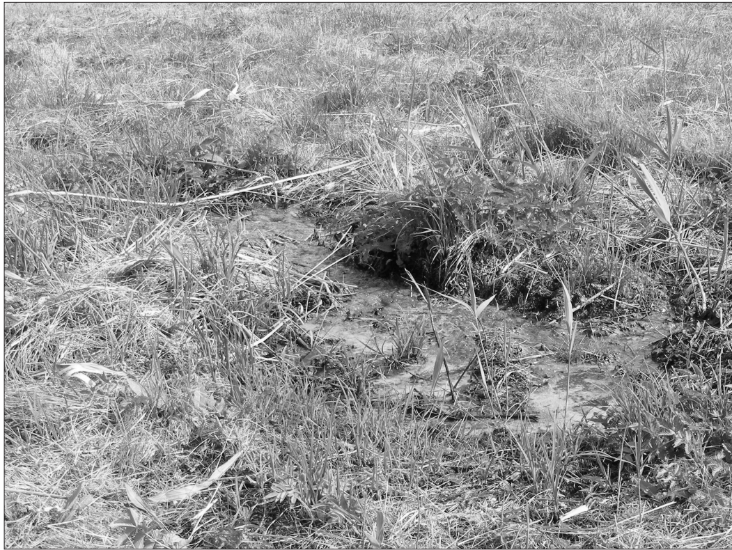
Fig. 4. The limonitic spring creates wetland habitat