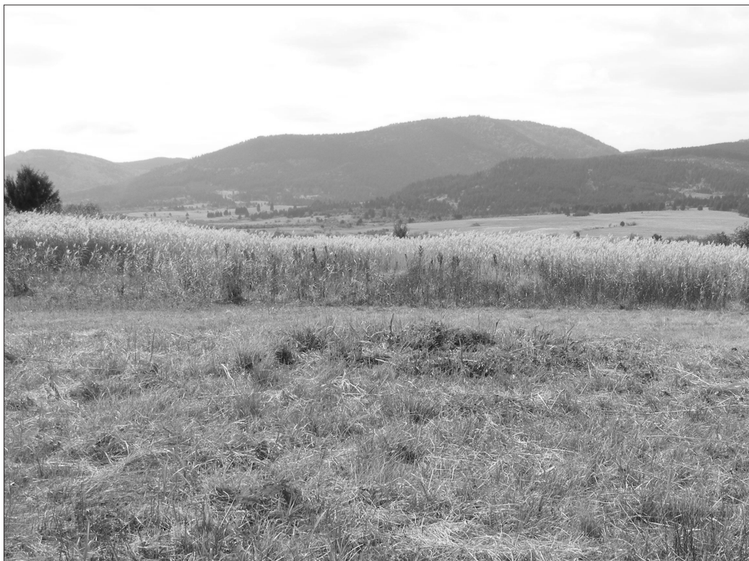
Fig. 5. The limonitic con, small hills of 10-15 m diameter with a spring on the top