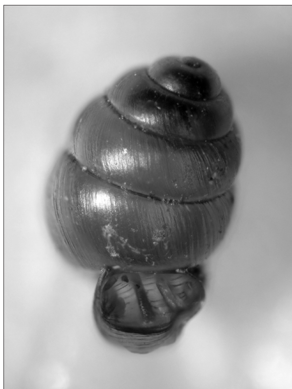
Fig. 3. Vertigo antivertigo