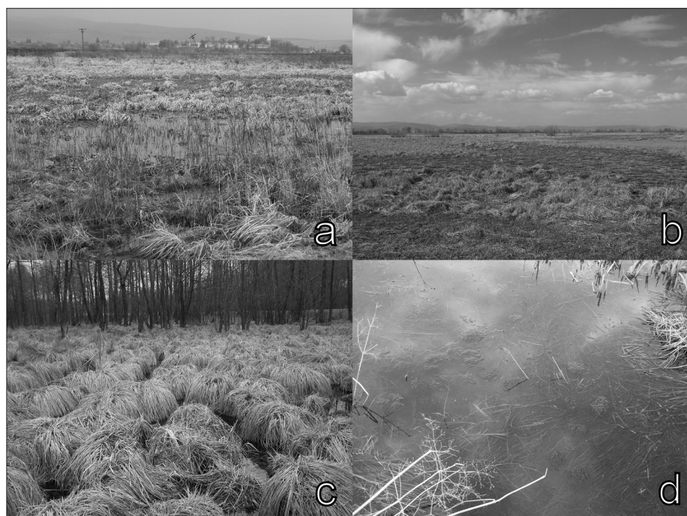
Figure 3. Typical moor frog ( Rana arvalis ) breeding habitats. a. Ţufălău, b. Tamaşfalău, c. Reci, d. Moor frog egg clumps in a pond from Peteni

2. ábra Mocsári béka ( Rana arvalis ) egyedek. a. Szárazföldi példány Zaboláról, b. Hím és nőstény példány a szaporodási időszakból, Martonfalváról, c. Nőstény példány Martonfalváról, d. Szárazföldi példány Szentkatolnáról