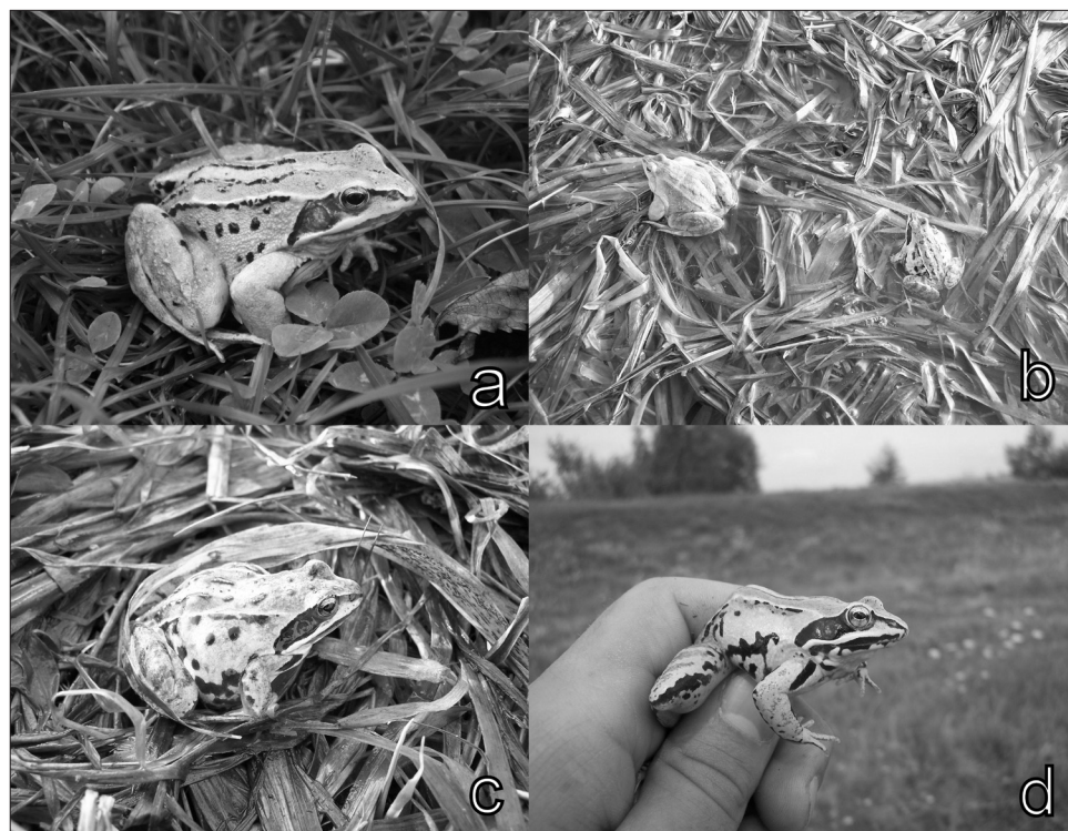
Figure 2. Moor frog ( Rana arvalis ) individuals. a. Terrestrial individual from Zábala, b. Male and female from Mártoneni in the breeding period, c. Female from Mártoneni, d. Terrestrial individual from Cătălina

2. ábra Mocsári béka ( Rana arvalis ) egyedek. a. Szárazföldi példány Zaboláról, b. Hím és nőstény példány a szaporodási időszakból, Martonfalváról, c. Nőstény példány Martonfalváról, d. Szárazföldi példány Szentkatolnáról