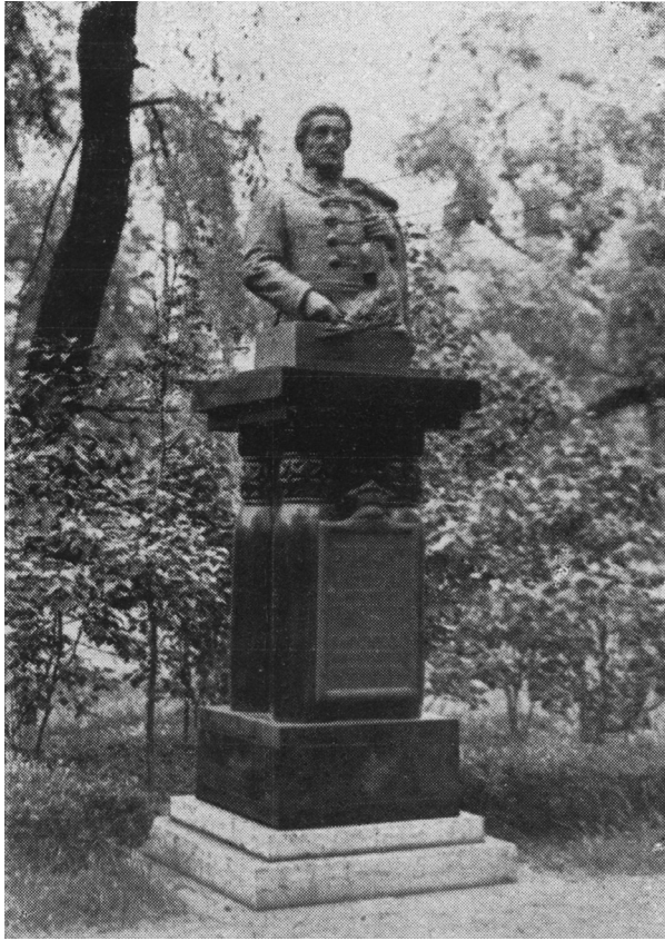
Figure 1. László Vaszary. János Bihari . 1928. Bronze. Margaret Island, Budapest (1928–1944/45). In Budapest szobrai és emléktáblái (The sculptures and memorial plaques of Budapest) by Endre Liber (Budapest: Budapest Székesfőváros Statisztikai Kiadóhivatala, 1934), 347.