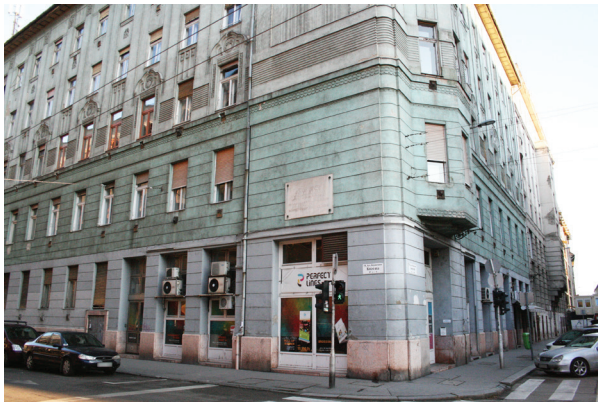
Figure 3. Memorial plaque to János Bihari. 34 Lónyay Street, Budapest, 1928.