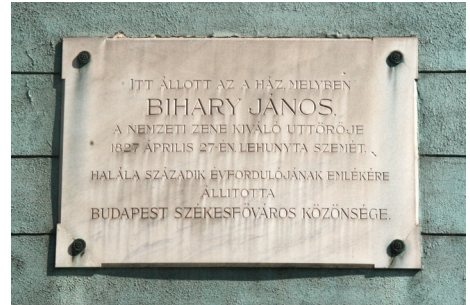
Figure 4. Memorial plaque to János Bihari. 34 Lónyay Street, Budapest, 1928. Text of inscription: “Here stood the house in which János Bihary, the outstanding pioneer of national music, closed his eyes on 27 April 1827. In memory of the centenary of his death installed by the public of the Royal Seat and Capital City of Budapest.”