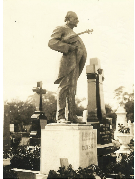
Figure 2. Lőrinc Siklódy. Béla Radics . 1932. Bronze. Kerepesi Road Cemetery, Budapest.