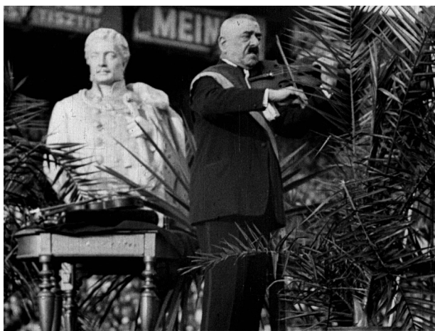
Figure 6. A fundraising concert for Béla Radics's tomb monument, organized by the National Association of Hungarian Gypsy Musicians in a football stadium on Üllői Road, Budapest, on 29 May 1930. Still from newsreel footage (Magyar Híradó [Hungarian News], episode 328, June 1930, Budapest: Magyar Filmiroda Rt.).