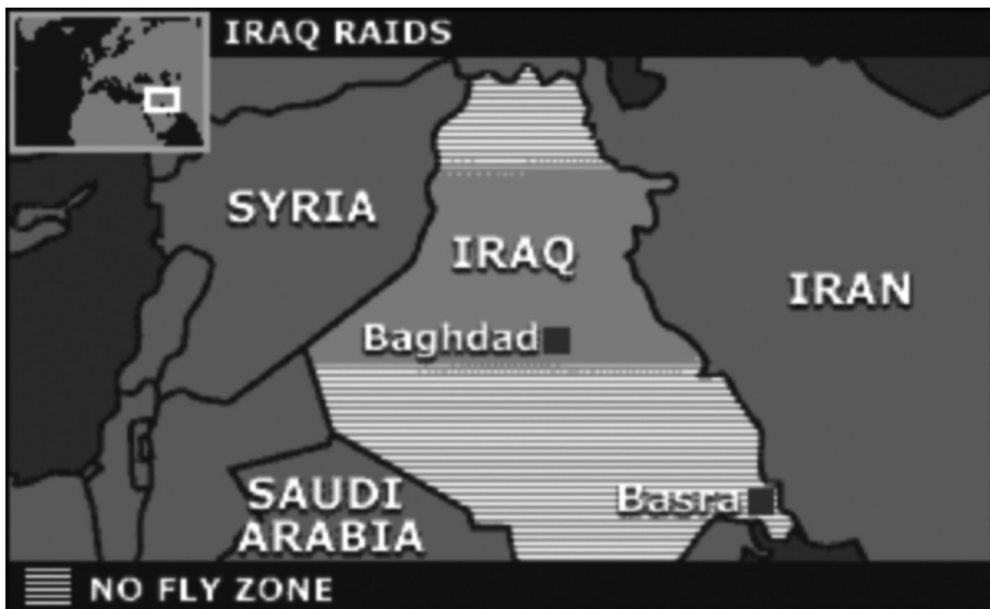
Figure 2. No-fly zone in Iraq between 1990 until 2003. [33]

Another main catalyst that helped keep the region on the boiling is the Iraqi invasion. On 2 nd August, 1990 Iraq invaded its neighboring country Kuwait, as was a result of disputes about oil production. This led to the UN sanctioned international coalition led by the USA, who used ground, maritime and air forces to force Iraqi troops to leave Kuwait. Within days the Iraqi forces were forced out. [1] However, the sanctions never came to an end even after the ceasefire. A no-fly zone was inflicted until the second invasion of Iraq. (See Figure 2.) This no-fly zone helped empower the Kurds in the north and empower the Shia in the south. After the termination of the Saddam Regime through the Iraq invasion in 2003, a new weak Shia regime was established. Hence the weak government and system lived at the tensions that led to failed statehood facilitated internal conflicts, especially with the existence of three different parties (Shia, Sunni, Kurds), with different visions and different views of the new Iraq.