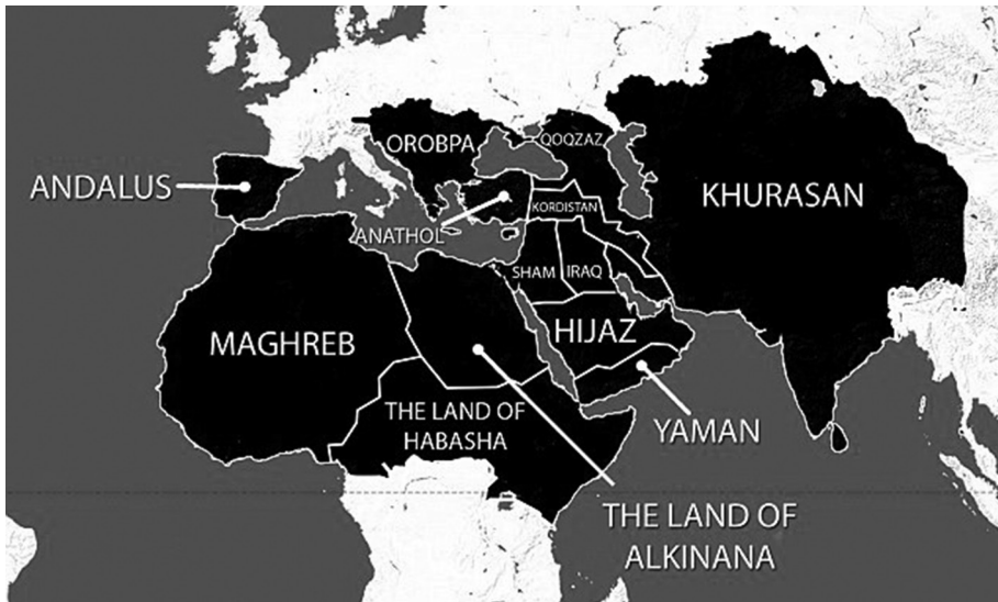
Figure 3. Islamic State according to ISIS. [11]