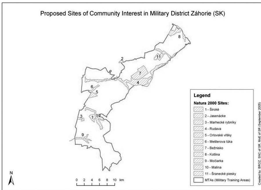
Figure 2. Proposed Sites of Community (SCI) in Military District Záhorie. [10]

At present, ten SCI with a total area of almost 5 000 hectares are located in Záhorie MD, while proposals of other sites have been elaborated. (Figure 2)