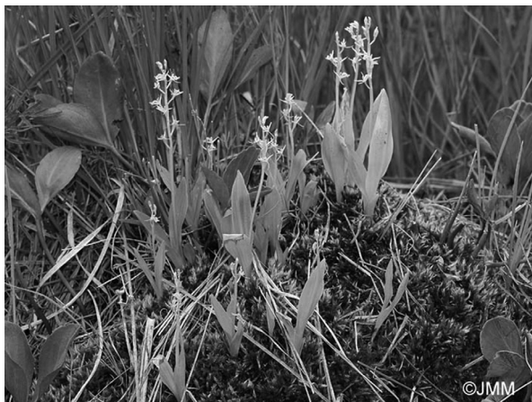
Picture 1. Fen Orchid ( Liparis loeselii ).

The occurrence of some of the plant species, such as Alpine Bulrush ( Trichophorum alpinum ), Meadow Bistort ( Polygonum bistorta ), Wild Calla ( Calla palustris ), Round Leaf Sundew ( Drosera rotundifolia ) and some Peat Moss species ( Sphagnum spp. ), in Záhorie Military District is indeed remarkable as they represent the species that have been sustained in the region since last glaciation when there was a sub-arctic climate in Záhorie. The tiny Fen Orchid ( Liparis loeselii ) is one of the rarest species of Community interest that can be found within the area. (Picture 1) Moreover, the Záhorie MD harbours the largest population of a Fen Orchid in Slovakia.