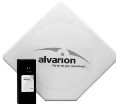
Figure 8. IDU and ODU units of alvarion Ethernet antenna [11]

Thanks to the advanced multipath contact of the ODFM, the system does not need a direct line of sight between the antennas. The system supports other adaptive modulation methods such as the BPSK 14 the QSK, or the quadrature amplitude modulation (16, 64 QAM).