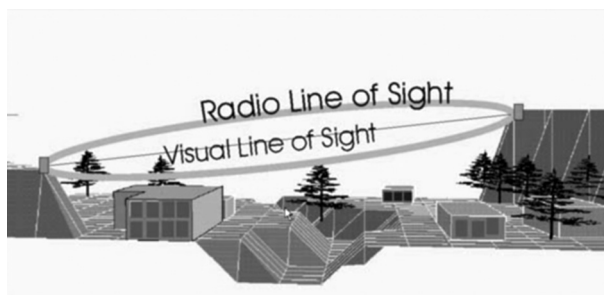
Figure 6. Line of Sight [10]

The secure establishing of the connection is realizable with encrypted, closed-channel microwave management. This type of connection has the same characteristics as the wire networks so it is very well able to establish temporary connections which can replace a wire network. The range is extendible by using higher gain antennas and a Point to Point or a PMP 8 connection is also established. The Point to Point connections are suitable for bridging distances more than tens of kilometres with high-speed data transmission speed. Besides the use of 5GHz ISM bands, we can use the frequency bands designated by the National Media and Communications Authority. Most of the small sized, deployable antennas have IDU-ODU 9 systems, which include indoor and outdoor units. It operates on the principles of SNMP 10 and support Qos services and bandwidth management in order to be effective.