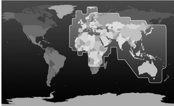
Figure 4. Thuraya coverage map [7]

It is necessary to provide a kit of Thuraya XT–Dual phone for the mobile sampling group which is water–, shock– and dust resistant and suitable for application at a GSM band (900/1800/1900 MHz) besides satellite connection. This is an excellent option in the case of the mobile network coverage appropriate in the region. In this case the satellite communication can be omitted which carries out a cost–effective connectivity. Naturally, in those areas where the terrestrial infrastructure is not available, the satellite connection is realizable. The Thuraya XT–dual device is usable for communication while moving without significant loss of satellite signal, thanks to the advanced technology, its special antenna and the extremely strong system. It is also possible to use in-vehicle by a connect to the car kit. It has high talk and stand–by time and is suitable for data transfer along with voice communication. It has Bluetooth and message sending functions (SMS, MMS, e–mail, Fax), and emergency SMS function. The great advantage of the device is that it can receive satellite calls with a covered antenna so the significance of this device is portability.