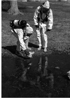
Figure 3. Sampling method [3]

It is a significant factor that it has to be able to communicate in an area without communication infrastructure. The satellite link is one of the most suitable solutions for establishing a connection. Its advantage is that it is less sensitive to the terrain conditions and it has a high capacity of availability, but its major disadvantage is the huge traffic charge. Satellite communication has a great importance both in civilian and in military (defence) signal areas. The currently applicable satellite phones can provide all requirements which are necessary nowadays in a modern infocommunication society and also suitable for serving the bio-laboratory. Therefore the satellite data transfer allows continuous, highly reliable voice and data traffic between the users and the remote endpoints.