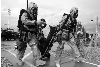
Figure 1. Sampling Group [1]

The sampling unit is a group equipped with special sampling devices and other additional components (see on Figure 1.). It moves via motor vehicles, possibly by aircraft (helicopter). Its members carry out various sub-tasks during the sampling which are an important influence factor in the planning of the establishment of the communication system. Beyond the sampling they perform the appropriate (temporary and safe) storage of samples and the reliable delivery of them to the deployable laboratory.