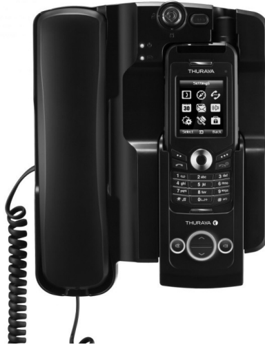
Figure 5. Thuraya FDU and XT-Dual [8]

The above described device is excellent for serving the sampling group's communication needs. Although there are many devices to choose from, in our opinion the devices made by Thuraya, in the present case, have several positive characteristics. [9]