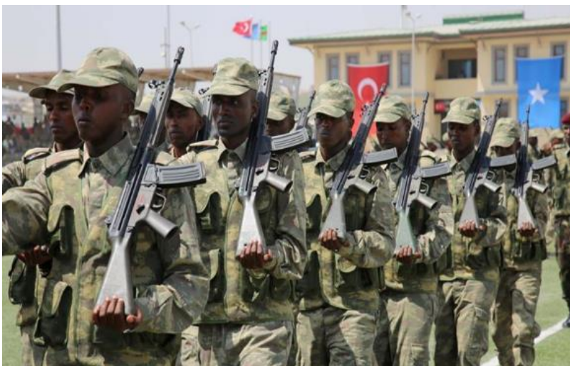
Picture 2. Somali soldiers in Turkish Task Force Command