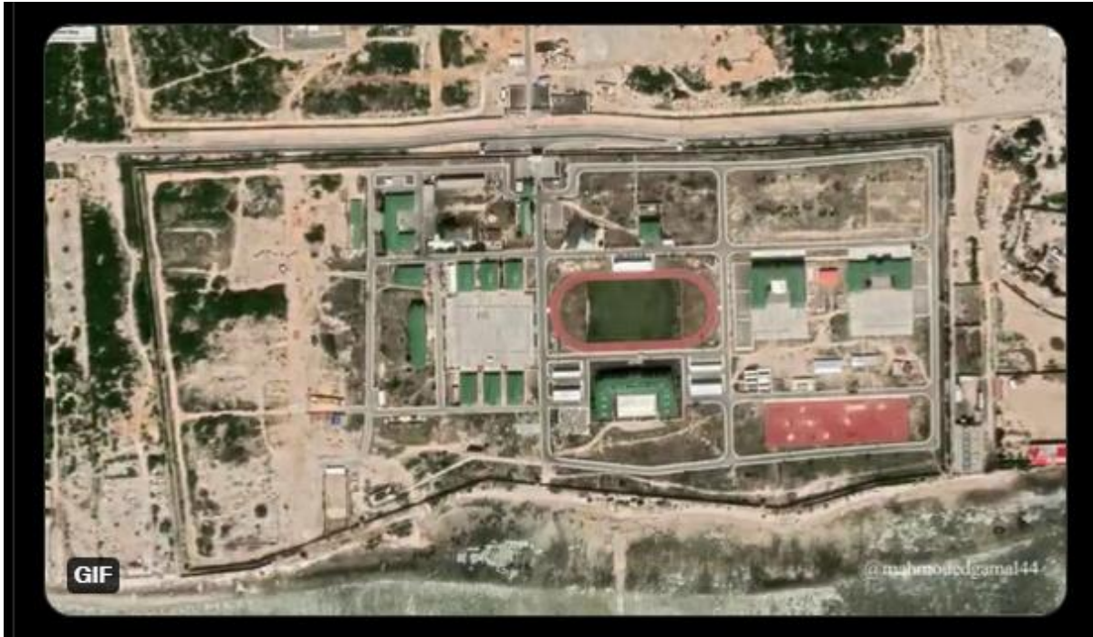
Picture 2. The Turkish Task Force Command in Somalia (STGK) finished in 2017.