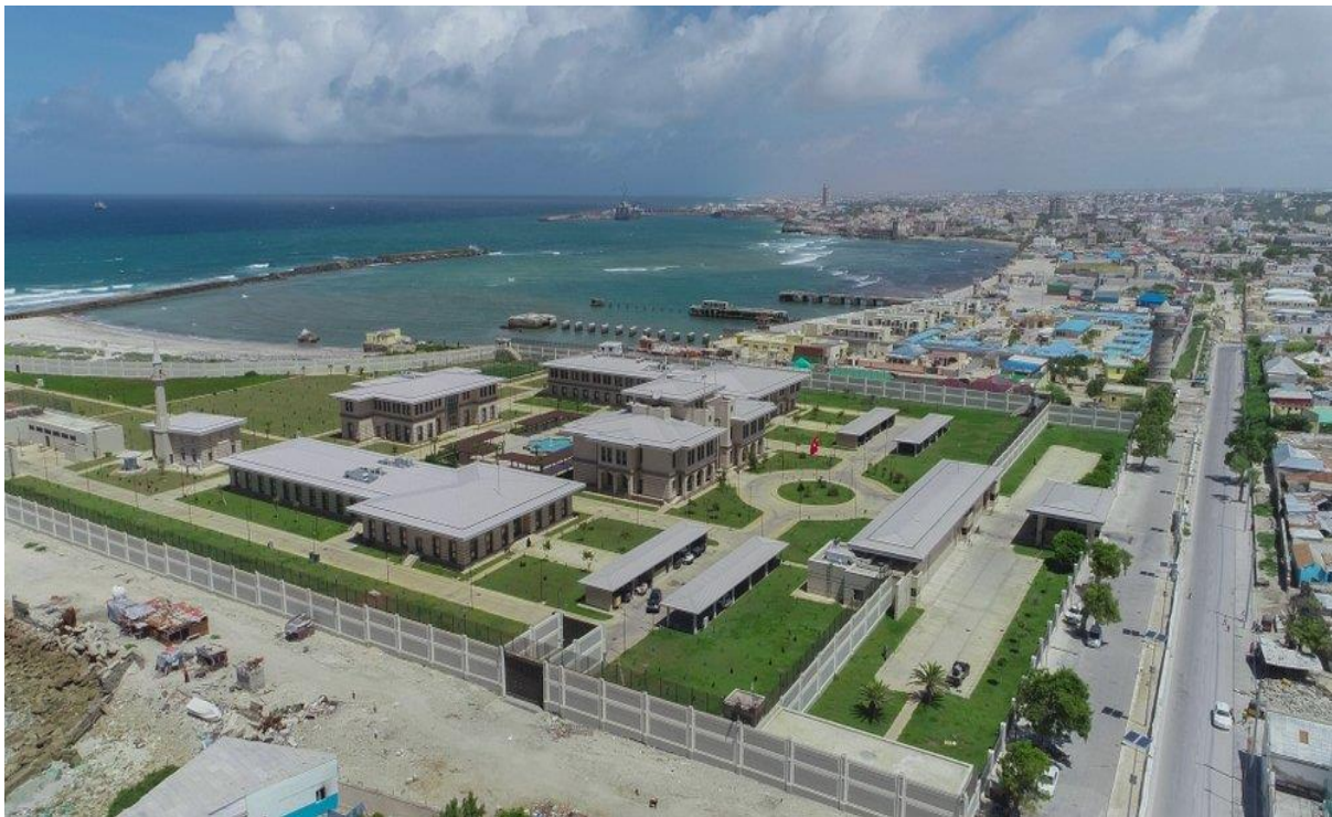
Picture 1. The largest Turkish embassy in the world is in Mogadishu, Somalia