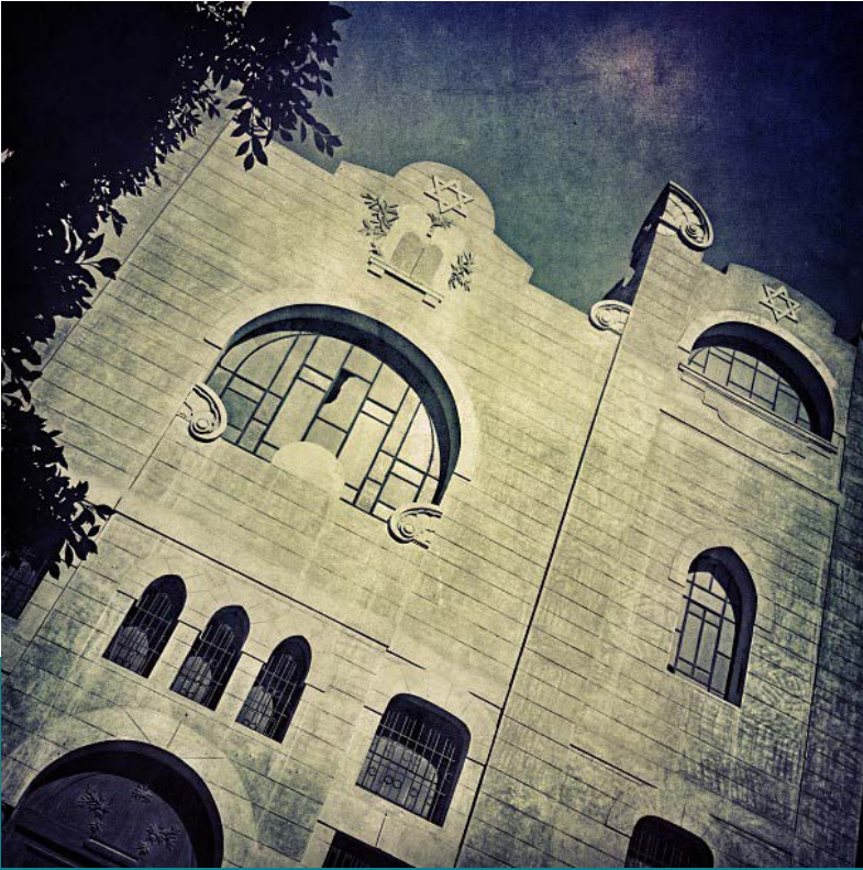
Moussa al-Dar'i Karaite synagogue in Cairo