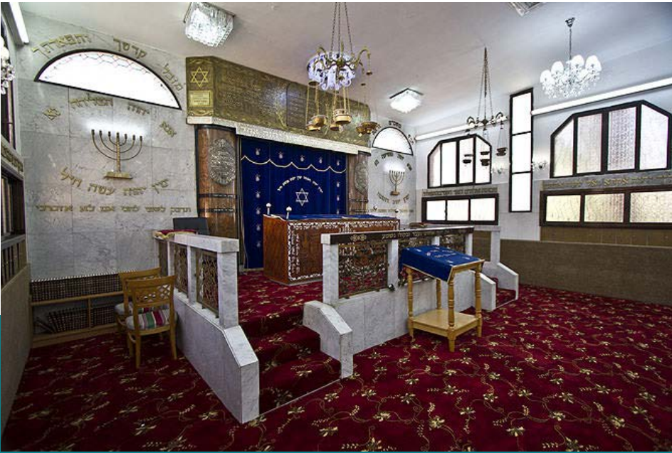
Karaite synagogue, Ramla Karaites World Center

Neither explanation of Karaite origins is satisfactory. Anan founded a group called Ananites who eventually coalesced with the Karaites, who then retroactively adopted Anan as one of their leaders; thus, Anan was not the founder of Karaism. Even though later Karaites revered Anan, they rejected quite a number of his legal teachings. Anan may very likely have been of the exilarchic family, but there is no indication that he was a rejected candidate for the position of exilarch. The Karaite assumption of continuity from Mt. Sinai is hard to corroborate, as is the story of Shimon ben Shettah's invention of a new (Rabbinic) religion. Although we have non-Rabbinic Jewish religious groups during the Second Temple period (most notably Sadducees and the Dead Sea Scroll covenanters), and despite some similarities between those groups and the medieval Karaites, there is no evidence of Karaite continuity from the destruction of the Second Temple (70 CE) to the emergence of the movement of people who called themselves Karaites ( benei mikra ) in the ninth century.