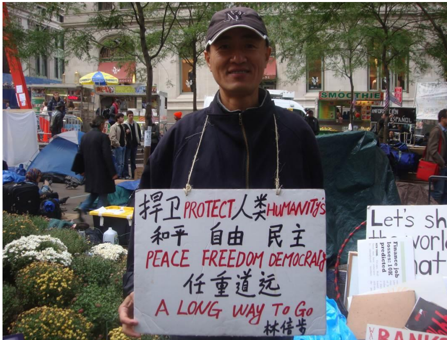
Figure 9: This demonstrator could be found at the edge of Zuccotti Park nearly every day that I visited.