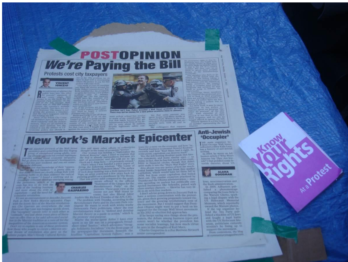
Figure 11: At Zuccotti Park, demonstrators displayed The New York Post's latest smears against them.