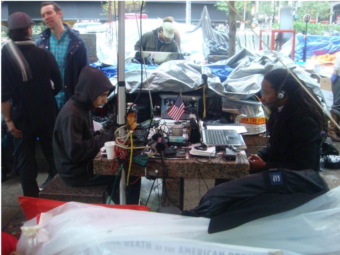
Figure 10: Freely accessible WiFi made Zuccotti Park a good place to broadcast Occupy discourse.