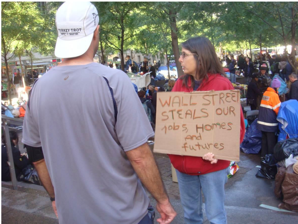
Figure 1: In the heart of New York's Financial District, a marginalized narrative reached thousands of daily visitors.

As I show in this article, authorities turned to paramilitary force only after soft, discursive tools proved ineffective. The first strategy for remarginalizing Occupy – ignoring the demonstrations – did not succeed, primarily because Occupy had leveraged its own communication systems to circulate its anti-corporate message to a wider and wider audience. The second strategy – tarring Occupy as unworthy of association – had only limited success because Occupy’s message had mass legitimacy after the financial collapse of 2008.