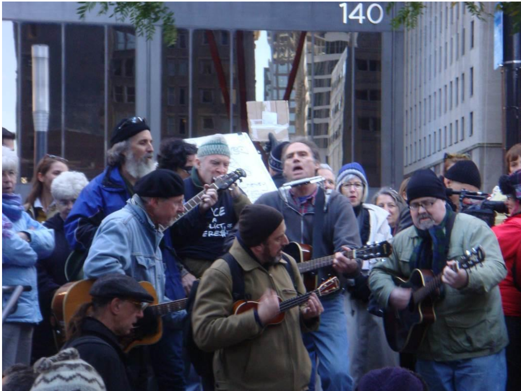
Figure 2: At Zuccotti Park, tourists stopped to check out the many intriguing spectacles.

How, then, did Occupy develop into a threat? What were the conditions that allowed Occupy's oppositional themes and utterances to gain wide circulation and high profiles? How did Occupy amplify the discontented voices of ordinary people?