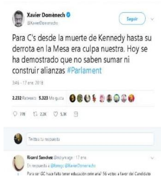
Image 6. Biased Attributions and Fallacy