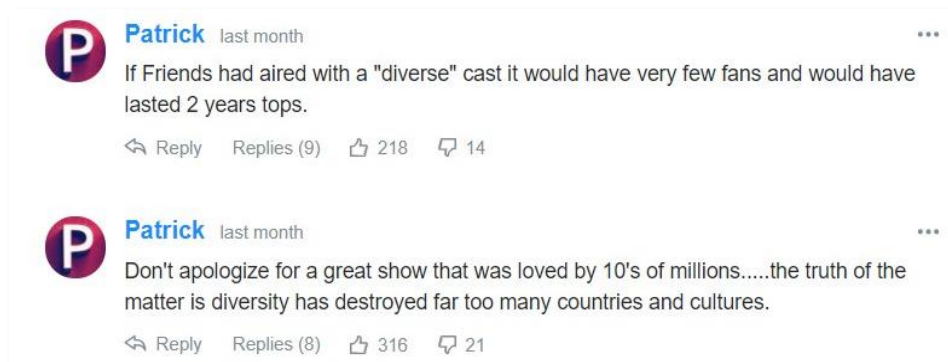
Figure 5. "Twitter user Patrick on Friends and diversity." Screenshot from Twitter. 2020.

Even as cancel culture and diversity initiatives may overlap, they are not the same. Cancel culture is a consensus to end taboos, whereas diversity initiatives constitute an attempt to add new perspectives to an otherwise homogenous creative landscape. Even still, there are audiences who believe that diversity initiatives are a type of cancelling, or destruction, of creativity (Figure 5).