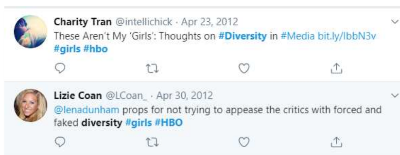
Figure 1. “Girls criticism and praise on Twitter.” Screenshot from Twitter. 2020.

critics. Even before the premiere, critics like Judy Berman had early access, and posted articles decrying the series for covering “first-world problems” from a “white lens.” As Berman (2012) suggests in an April 13 article (before the premiere), several popular shows of the time were guilty of promoting white “problems” without diverse voices entering in— Two Broke Girls , How I Met Your Mother —and yet, the need to examine Girls , and then examine it again, was oddly acute (para. 5). On the date of the premiere, April 15, 2012, viewer angst and independent think-pieces on the lack of diversity, like the Intellichick post “These Aren’t My ‘Girls’,” were widely shared on Twitter. Before such posts, there seemed to be an unspoken agreement from formal critics that the show “spoke” to young women’s issues in big-city life. Not every Twitter user was unhappy with Girls , as @LCoan_’s tweet (Figure 1) gives Dunham “props” for avoiding what she deems “forced and fake diversity.”