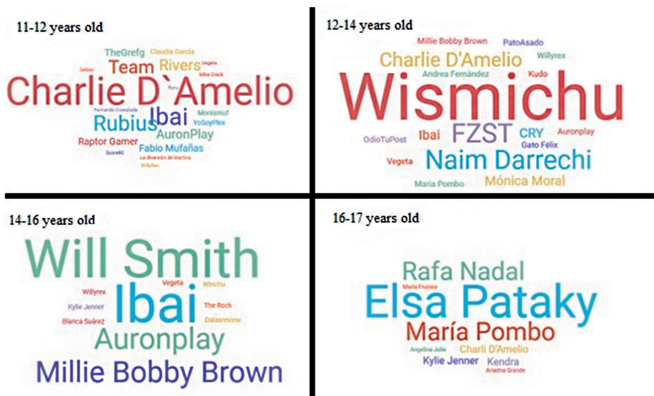
Figure 1: Influencers followed by adolescents by age Source: Compiled by the authors.

Younger adolescents were increasingly drawn to profiles that were more focused on social media and became famous through their online activity, such as Charlie D’Amelio, Rubius, Wismichu and AuronPlay. However, participants between 14 and 16 years old tended to follow individuals who were famous for activities beyond social media, such as singers, athletes and actors, including Elsa Pataky, Rafa Nadal, Millie Bobby Brown and Will Smith. This shift in preferences may be related to the fact that adolescents between 11 and 14 expected a more intense and personal relationship with social media influencers.