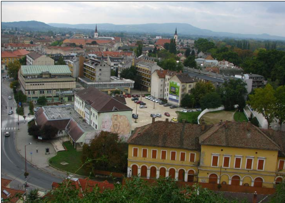
FIGURE 3–4 View of Centrum about 1960 and today