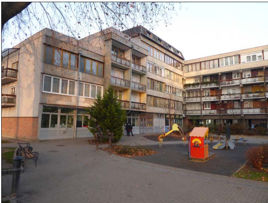
FIGURE 10 The final Version of the Reconstruction