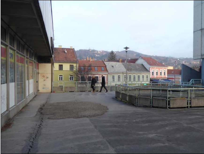
FIGURE 11 The elevated sidewalk of the department store with view of old town