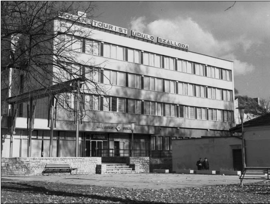
FIGURE 5 Hotel Volán for “for simpler lodgings”