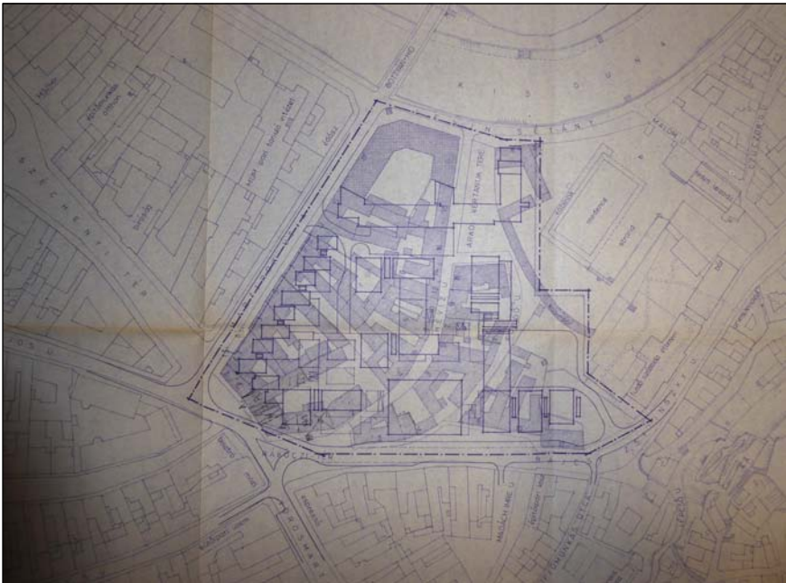
FIGURE 6 Regulation plan for the Centrum