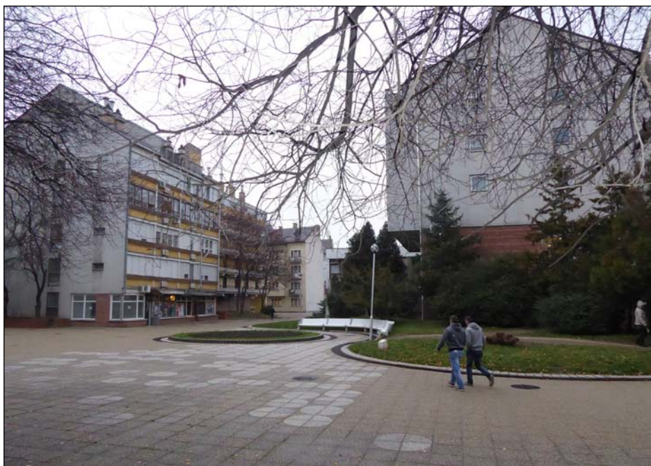
FIGURE 7–8 The street “Hévízköz” before the reconstruction and the today character of the Centrum