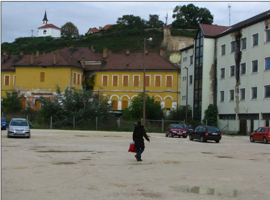
FIGURE 12 Degradation of the city centre