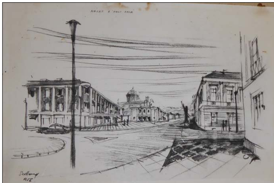
FIGURE 2 Plan for the Centrum