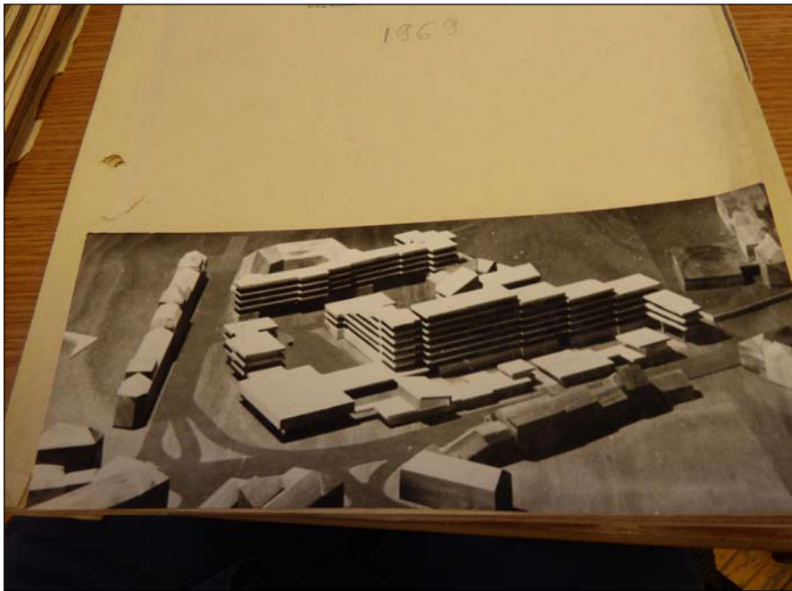
FIGURE 9 Model of first Version of the Reconstruction