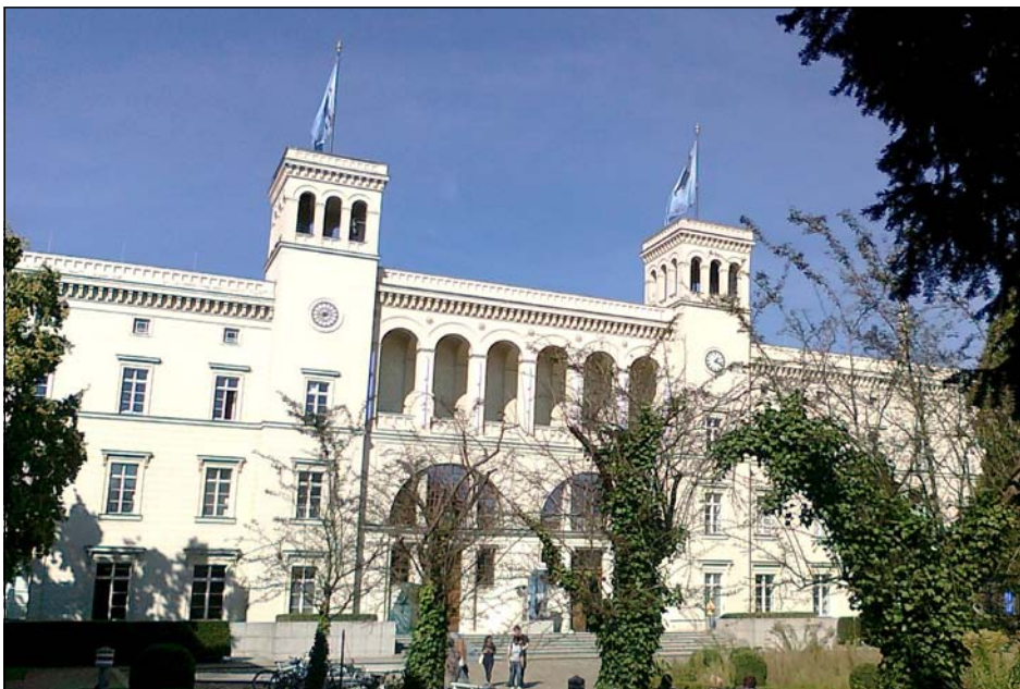
FIGURE 6 The former "Hamburger Bahnhof" (Hamburg Railway Station), now museum of contemporary art