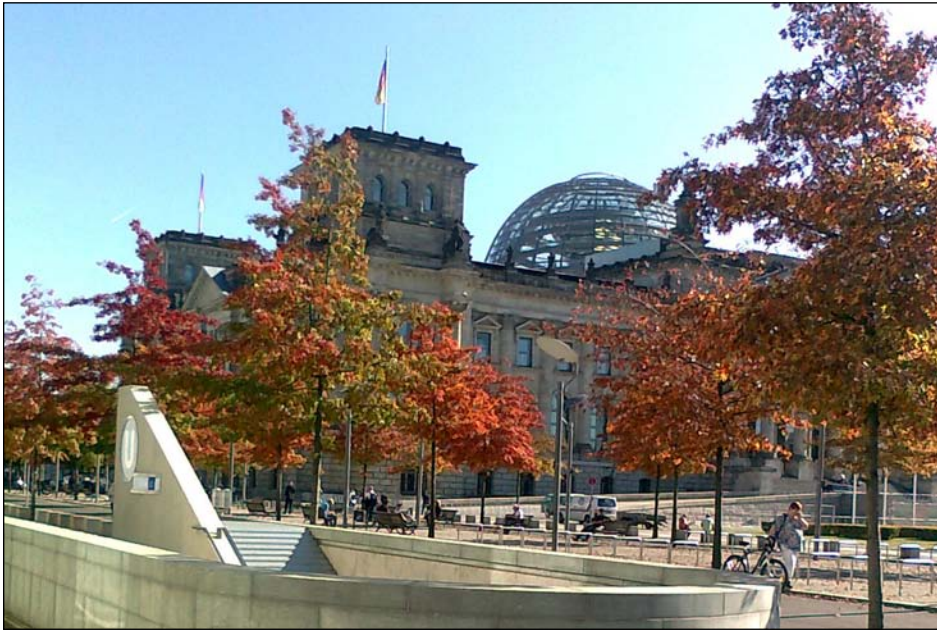
FIGURE 5 The Reichstag , seen from the entrance of the underground station