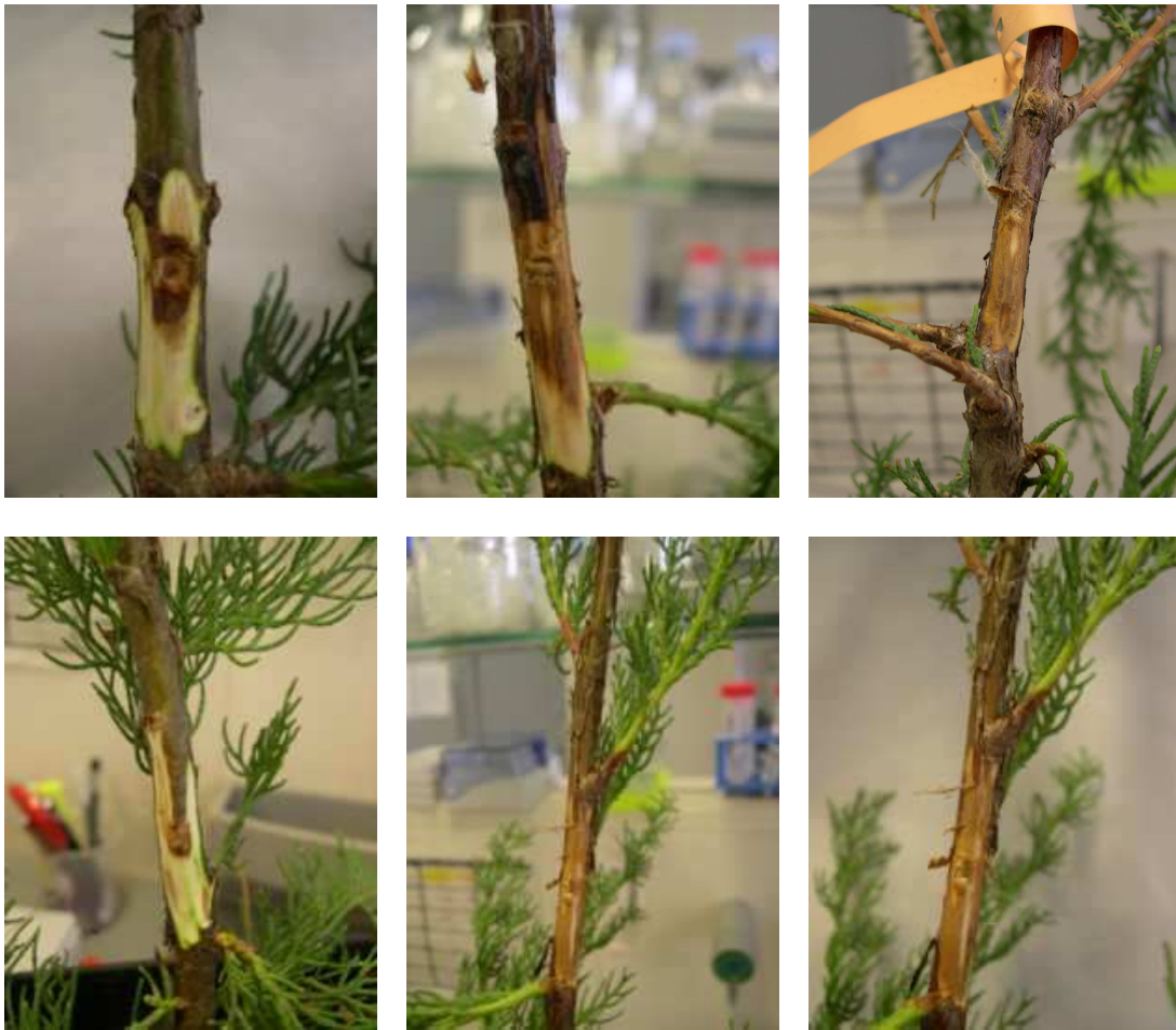
Figure 1. Phases of sampling of the host stem tissue 30 days after inoculations.