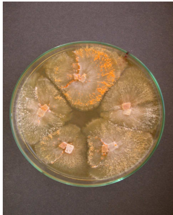
Figure 6. Test of vegetative compatibility