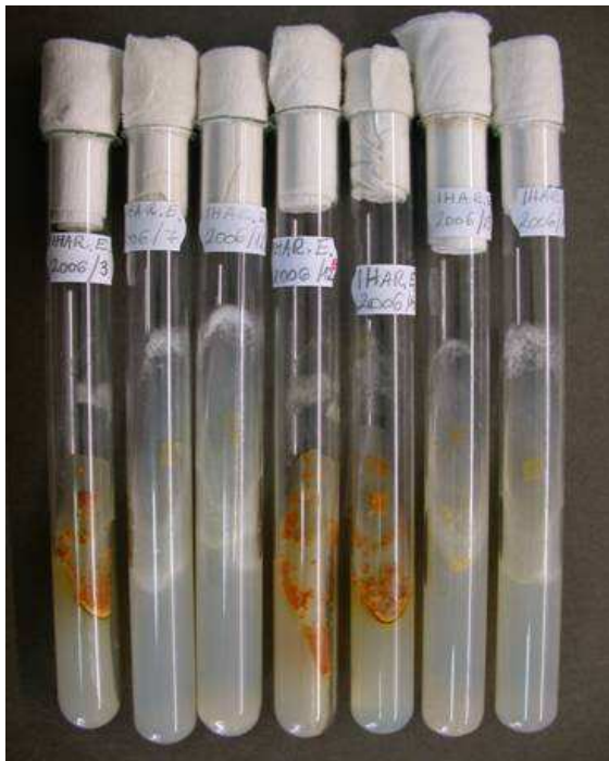
Figure 5. Virulent and hypovirulent isolates of C. parasitica