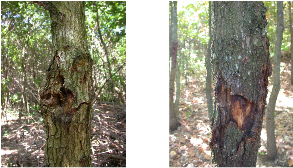
Figure 1. and Figure 2. Symptoms of Cryphonectria parasitica infection in Quercus petraea