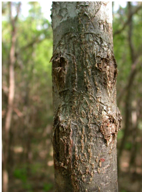
Figure 10. Changing suberisation in the hypovirulent inoculations