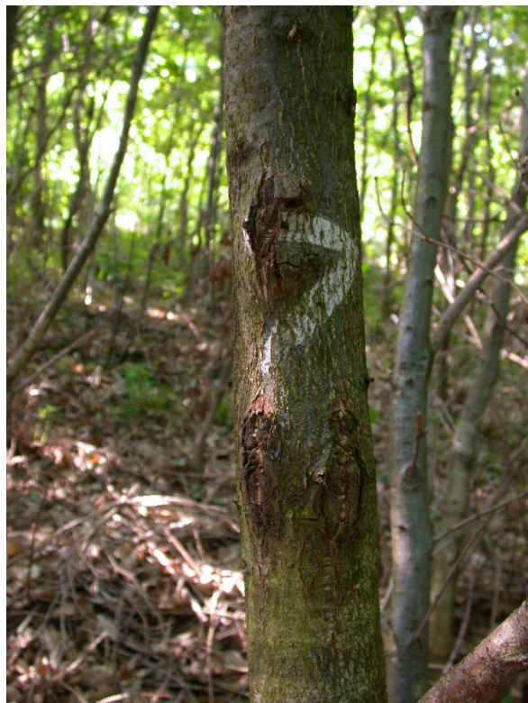
Figure 9. Healed virulent inoculations

The wounds recovered during the first year in the trees inoculated with hypovirulent strains and control trees, no or minimum phloem necrosis occurred. Slight alteration of suberization was observed in some trees inoculated with hypovirulent strain indicating the presence of the hypovirulent fungus in the outer bark (Figure 10).