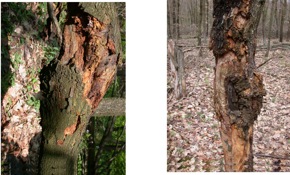
Figure 3. and Figure 4. Large perennial cankers in Q. petraea caused by C. parasitica