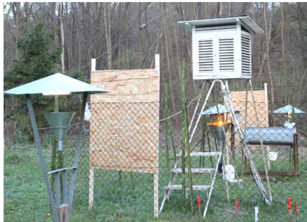
Photo 4: Simultaneously operating light traps in the seminatural site