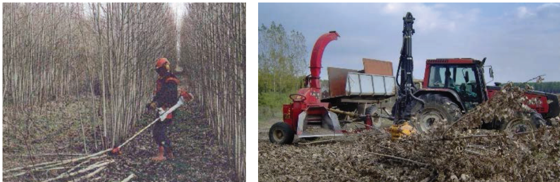
Figure 5-6. Small-plantation harvesting technology for a plantation below 3 ha

In the case of small energy plantations, manual power tools and low-power machines are optimal. A motor chainsaw or clearing saw is appropriate to fell individual trees. A mobile chipper operated by a crane power tool can carry out wood chipping for trees felled in the same direction. Once again, a tractor with a trailer is the most suitable machine to forward wood chips. A crane truck is the most effective equipment for loading and transport (Figure 5-6).