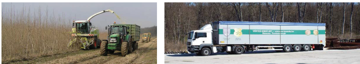
Figure 1-2. Large-plantation harvesting technology for a plantation of 20 ha or more

In the case of large plantation areas, the application of high performance machines is more favourable economically. A single machine, the so-called self-propelled walking chipper, executes the felling of individual trees of the plantation (felling), places the felled trees into a chipping chamber, chips the felled trees, and loads the wood chips onto the forwarder. Delivery equipment, more specifically tractors and trailers, forward the wood chips onto the loader and complete the unloading (dumping). A front loader then loads the wood chips onto the transporting truck (tractor with semi-trailer) ( Figure 1-2 ).