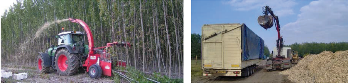
Figure 3-4. Medium-plantation harvesting technology for a plantation of 5-10 ha

Self-propelled walking chippers are not economically viable for the harvesting of medium plantations. In this case, it is better to apply a walking chipper that can be connected to a power tool as an adapter. In this way, the basic machine can also be used for other functions in addition to harvesting operations. The felling, chipping, and loading onto the forwarder all occur within a single operation in this case. As mentioned in the previous category, a tractor-trailer combination also completes the forwarding here, while a crane truck loads and transports the wood chips. (Figure 3-4).