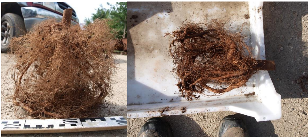
Figure 4. One-year-old Siberian elm roots (Ulmus pumila L.) washed for weight; measurement at the end of the second year of the experiment.

The height and aboveground biomass of Siberian elm plants were considerably higher in the red mud-treated soil mixtures than in the control. The root biomass ( Figure 4 ) showed quite the same effect, but with RM30, this difference was not significant. The roots showed such intensive growth that they nearly filled the entire volume of the culture pots by the end of the growing season, which again limited the magnitude assessment of the data. Although stem diameter was slightly higher for both mud treatments, no significant difference was detected.