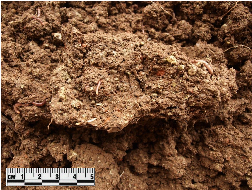
Figure 5. Initial soil formation resulting in soil structure can be detected with the naked eye, during the breaking of the pots in the second year of the experiment.

study is converted to 1 hectare of production area, 134 kg P/ha is obtained for the control, 44 kg P/ha for RM15 and 26 kg P/ha for RM30. As a comparison, ca. 2.92 kg P/ha active ingredient must be added to reach 1 t/ha yield of agricultural crops (Füleky 1999).