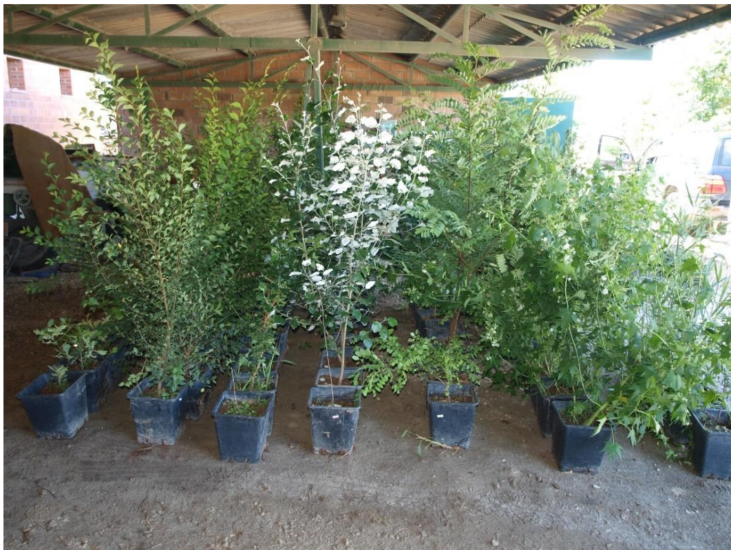
Figure 2. Plants collected for final measurements in the second year of the pot experiment in Székesfehérvár. The black planting pots are: 22.5 cm * 22.5 cm at top, 18.0 cm * 18.0 cm at bottom, height 26 cm. Plant species from left to right: 1.) Quercus robur L.; 2.) Ulmus pumila L.; 3.) Acer campestre L.; 4.) Populus alba L.; 5.) Robinia pseudoacacia L.; 6.) Sida hermaphrodita L.; 7.) Arundo donax L.

Seedlings were purchased from a forestry nursery in the nearby village of Moha (47°14'22.20" N, 18°20'44.89" E).