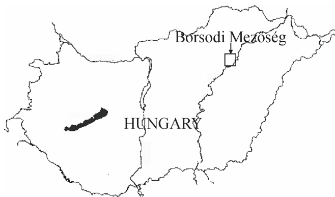
Fig. 1. The situation of Borsodi Mezőség.

Owl pellets were collected from 1994 in the 18 000 ha Borsodi Mezőség Landscape Protected Area (BLPA) within Bükk National Park, North-East Hungary. The area is a very diverse grassland habitat-complex scattered with wet habitats and arable lands, which was created and formed by traditional grazing agriculture in recent centuries. Before the river regulations of Tisza, wetlands were the most characteristic habitats of the region, and residues of these can be still found in great numbers, even today. Floodplain meadows (non alkaline) are characteristic on the southern part. Alkaline meadows are represented by some relict and endangered sodic forest meadows. The most extended plant community of the steppe is the dry alkaline steppe and the most valuable relict spots of the area in floristic and faunistic respect are the patches of loess-steppe grasslands. Other habitats of the region are abandoned plough lands, improved meadows, plough lands, introduced forests, rows of trees and farms.