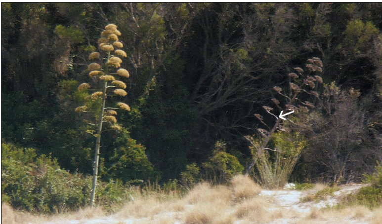
Fig. 1. Agave americana with live and dead bloom. Arrow indicating place of developing beetle in the plant

New host plant data: Croatia, Hvar, Hvar, Križni rat, N43°09'48.02", E16°26'44.95", 20 m, 26.07.2005.>22.06.2006, Agave americana , 1 adult female, Kovács, T. (Mátra Museum, Gyöngyös) – Rovanjaska, N44°14'53.41", E15°32'16.40", 2 m, 05.05.2006>28.06.2006, 1 adult male, Chritmum maritimum , Kovács, T. (Mátra Museum, Gyöngyös).