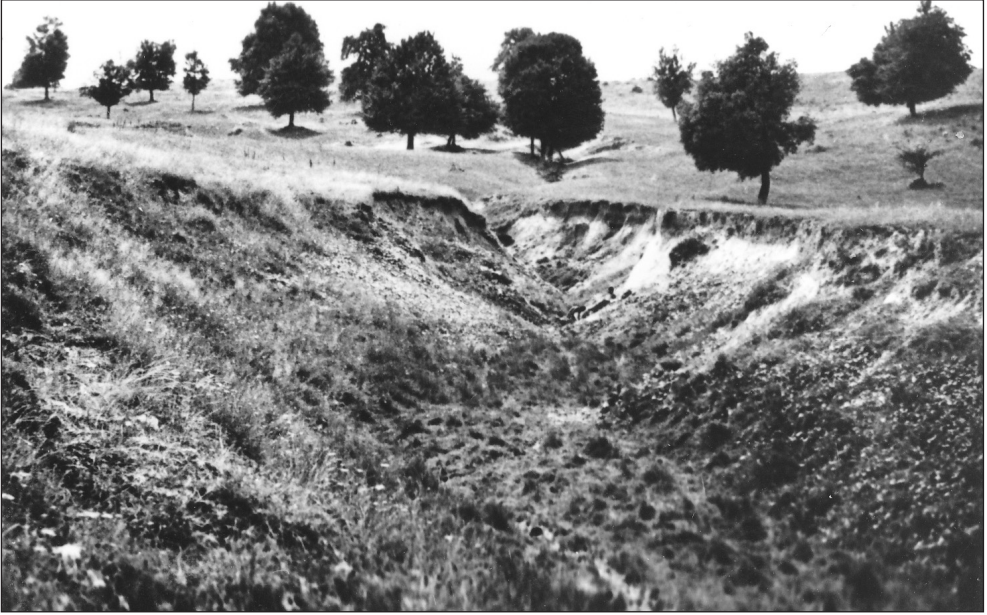
Fig. 2. Sediments revealed by a gully (site visit, 1964)