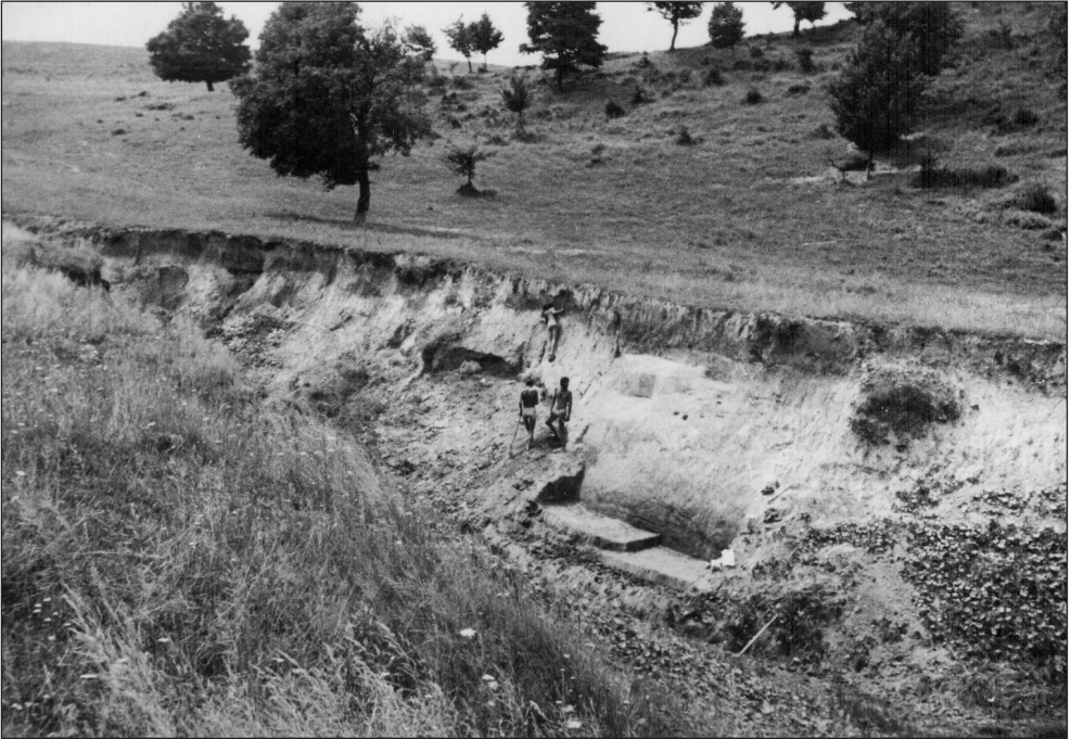
Fig. 3. The profile in the gully, excavated in 1969