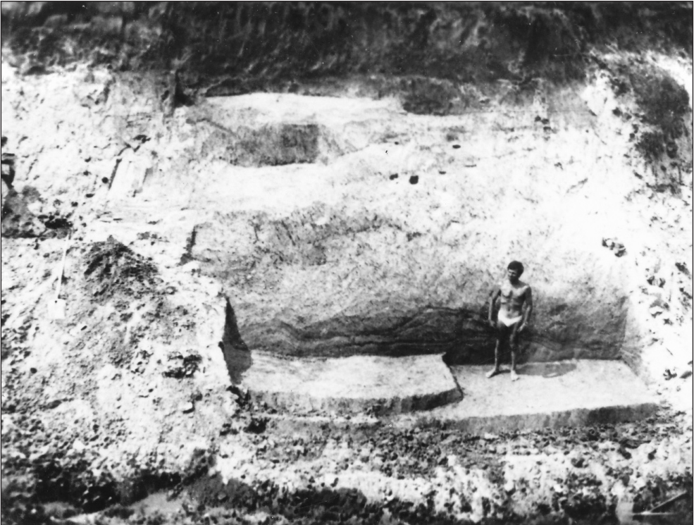
Fig. 4. The profile, excavated in 1969

The site was discovered on a site visit in 1964 by Ernő Horváth, the late paleobotanist of the Savaria Museum, Szombathely: “The glacial layers are revealed by a gully falling into the Toka Stream. Under the loess, sandy loess and loessial sand layers of the glacial layer, I found a grey sludge layer, which preserved the branch and stalk moulds of different plants. [...] Samples were taken from 16 levels of the excavations, since Molluscs can be collected almost in the whole area of the revealed 7–metre high wall.” (HORVÁTH 1973).