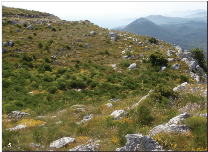
Figs. 4–5. 4 = Lixus obesus on hostplant ( Cachrys ferulaceae ), 5 = habitat of L. obesus

Mecinus janthiniformis Tosevski & Caldara, 2011 – Albania , distr. Shkodër, near Fushë Okol, N42°23'43, E19°42'42, 02.06.2014, leg: T. Németh (1 adult, CVS), det: V. Szénási. First records for Albania, cf: CALDARA & FOGATO 2013, FAUNA EUROPAEA 2004, LÖBL & SMETANA 2013.