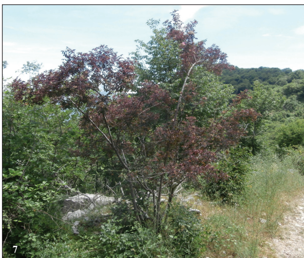
Figs. 6–7. 6 = Mecorhis ungarica on hostplant ( Rosa glauca ), 7 = habitat of M. ungarica

Mogulones javetii (Gerhardt, 1867) – Macedonia , municip. Velandovo, near Gradec, N41°22'42, E22°23'47, 670 m, 09.05.2013, leg, det: V. Szénási (2 adults, CVS). First records for Macedonia, cf: FAUNA EUROPAEA 2004, LÖBL & SMETANA 2011.