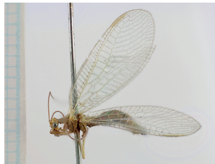
Fig. 3. Chrysopa phyllochroma specimen identified by Wesmael, lateral view. 1 square of the scale sheet = 1 mm.

To designate a neotype of Ch. phyllochroma for clarifying its taxonomic status (Code 75.3) (and taxonomic status of Ch. commata ) is necessary obviously. For this aim should be investigated (including detailed and accurate investigation of genitalia) several specimens, which eidonomically are Ch. phyllochroma , has locality label, and according to this label were collected somewhere around Bruxelles, and after it to choose one of them as neotype.