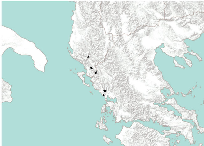
Fig. 1. Occurrence of Helenoperla malickyi in the Balkan Peninsula: ★ = locus typicus (confirmed with new data), ● = paratype locality (we did not visited); ▲ = new data

The turn up of Helenoperla malickyi Sivec, 1997, a new monotypic European perlid genus was a great surprise in the 90ies (ZWICK 2004). The taxon was first collected by the excellent trichopterologist Hans Malicky, and hitherto it was only known from the type specimens collected in two watercourses of the Greek Epirus (SIVEC 1997). Life cycle, cohabiting fauna and habitat demands remained largely unknown, and only ZWICK (2004) contributed to its larval taxonomy, on the basis of paratype specimens. During the last two decades, we re-collected it at the locus typicus, and found the species at a new Greek and 5 other Albanian watercourses (Fig. 1).