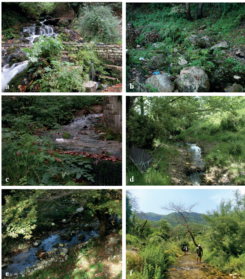
Fig. 2. Habitats of Helenoperla malickyi : a = Uji i Ftohtë, b = Bisticë, c = Syri i Kaltër, d = Vrysoula (locus typicus), e = Sotirë, f = Sotirë, after cutting off littoral Platanus orientalis