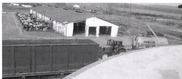
Figure 2. Biogas-plant built in the neighbor of dairy farm.