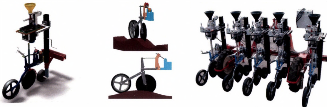
Figure 1. Digital prototype (left); example of a simulation with digital prototype (middle) and physical prototype of the precision plot seeder for medicinal and aromatic plants of the LfL with five electrically driven seeding units and passive compensation of the slope inclination (right)

develop reusable components, but on the other hand significantly affects the way of the design process. Inter alia the modularity of the mechanical system needs to be reflected within the controller architecture. Although the traditional programmable logic controllers (PLCs) still play an important role within implementation in machine control systems, a decision was made to implement an embedded controller. The aim was to improve the flexibility, to assure the advantage of condition monitoring, to provide possibilities for easier upgrading than on systems with fixed logic (adaptability in term of changing I/O requirements), as well as to use advanced control techniques based on machine vision, and motion control capabilities, if necessary. The developed embedded controller is based on single-board RIO (sbRIO) platform [9] and electronic expansion circuit board for signal conditioning developed at the institute. Speed and resource trade-offs are typical issues related to programmable gate Array (FPGA)-based implementations. Generally, FPGA takes the benefits of the high execution speeds on FPGA targets but the software design requires minimisation of the resource consumption. Even with trends like multi-core, a processor-based solution will never get the parallelism offered by FPGAs [10].