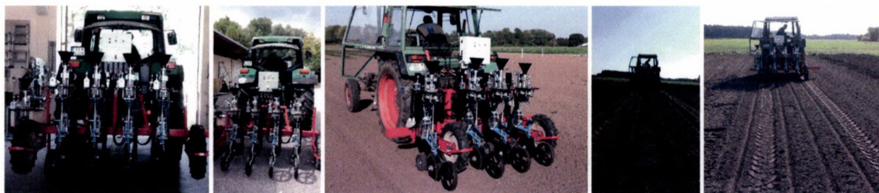
Figure 3. Testing of the precision plot seeder for medicinal and aromatic plants of the LfL with electrically driven seeding units and passive compensation of the slope inclination

The experiments under controlled conditions and virtual commissioning, only partially led to successful commissioning within the implementation phase, because only observations in a finite number of predefined and generally simplified scenarios can be carried out under such conditions. Hence, enough data needs to be collected during field tests under uncontrolled conditions to possibly identify the problematic scenarios which may not have been considered during the machine development or rather the design of simulations. By this means events and effects which couldn't be anticipated or observed previously could be explained.