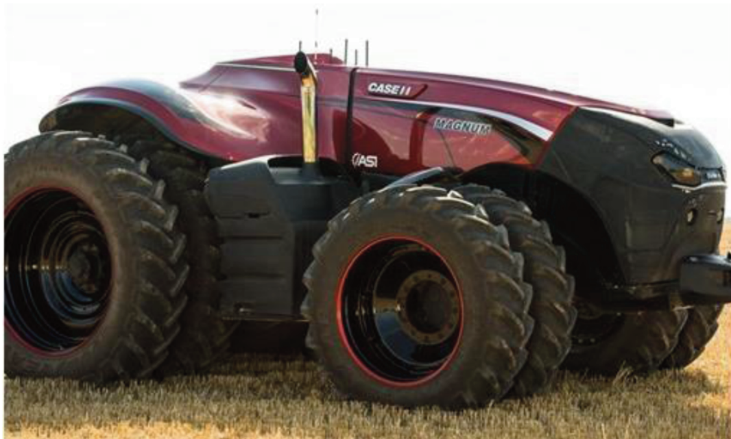
Figure 2. Case IH autonomous tractor

Case IH and CNH Industrial's Innovation Group based the cables autonomous concept on an existing Case IH Magnum tractor with reimagined styling. The vehicle was built for a fully interactive interface to allow for remote monitoring of pre-programmed operations. The on-board system automatically accounts for implement widths and plots the most efficient paths depending on the terrain, obstructions and other machines in use in the same field. The remote operator can supervise and adjust pathways via a desktop computer or portable tablet interface.