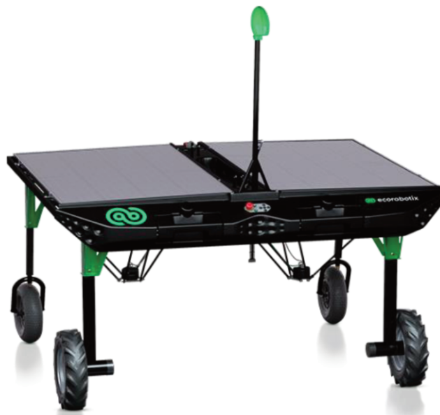
Figure 6. Ecorobotix with photovoltaic panels

Targeted application of herbicide by the first ever completely autonomous robot for the ecological and economical weeding of row crops, meadows and intercropping cultures. The robot works without being controlled by a human operator. It covers the ground just by getting its bearings and positioning itself with the help of its camera and GPS. Its system of vision enables it to follow crop rows, and to detect the presence and position of weeds in and between the rows. Two robotic arms then apply a micro dose of herbicide, systematically targeting the weeds that have been detected. In bare fields or meadows the robot positions itself precisely thanks to its GPS RTK.