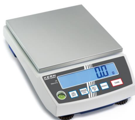
Figure 1. KERN PCB-type laboratory balance for measuring weight loss

The following materials were used to experiment: Cold storage room 'FRIGOR-BOX' with nominal 3.7\text{m}^3 capacity and a precision scale type KERN PCB ( 3500 \pm 0.01\text{g} ). (Figure 1)