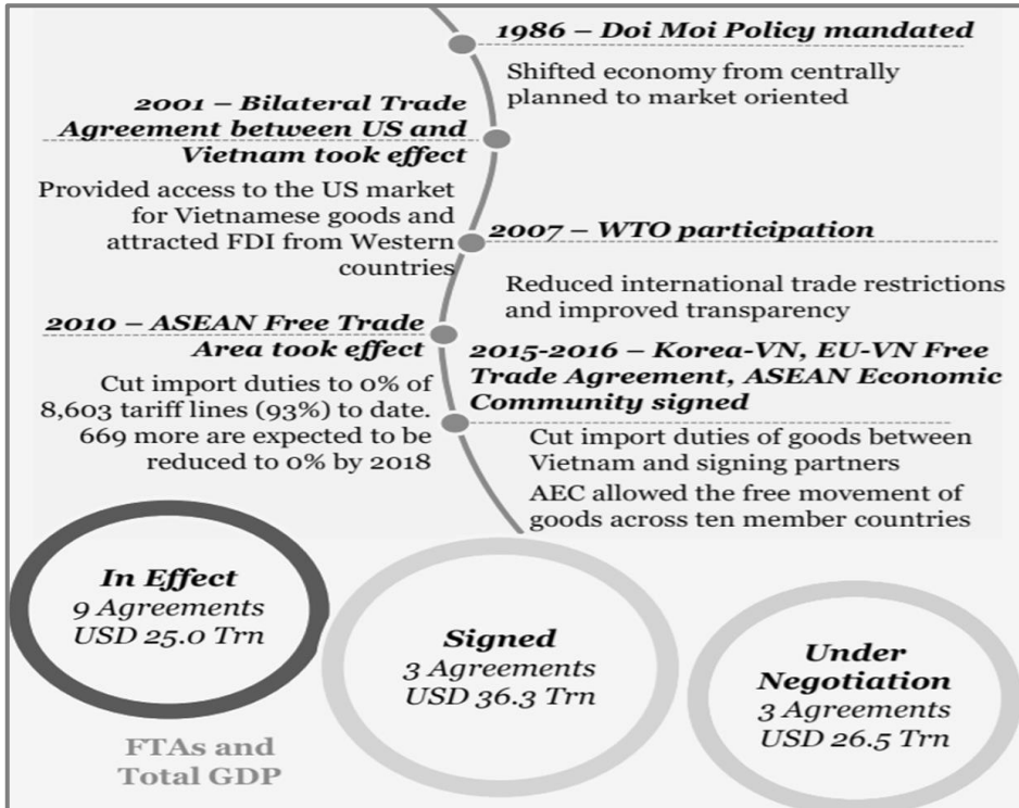
Figure 2: Vietnam’s Trade Liberalization Timeline

The main objective of the current document is to analyze what is driving foreign investors out of the Vietnamese banking sector and what could be done to keep the existing foreign players and attract the new ones.