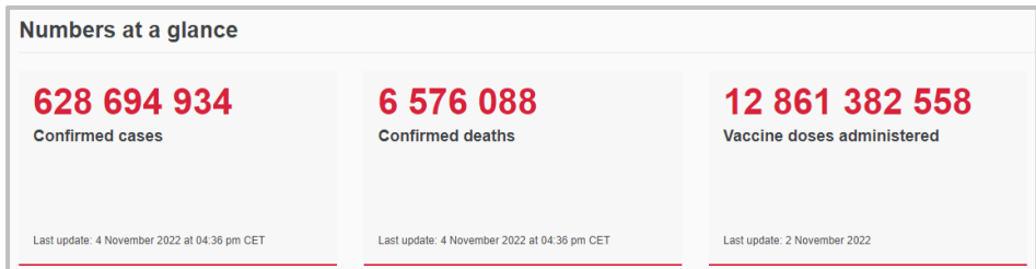
Figure 1: COVID-19 numbers

First reports of SARS-CoV-2 in December 2019 were of a new respiratory virus with only local impact, however the “ease of transmission, combined with a buoyant global economy and unparalleled mobility of the population escalated the virus to a significant threat” (Phillips, 2020:130). Almost 2 ½ years later November 2022, the WHO lists 6.5 million deaths and approximately 626 billion confirmed cases of COVID-19 (note: one person can have more than one infection) and highlights its significance.